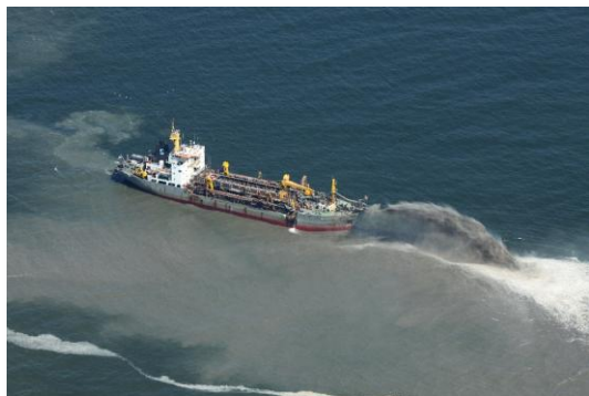
Stuyvesant Borrow Operations – September 23, 2010

Note: Under Construction represents linear footage of berm placed; all material may not yet conform to elevation +6.