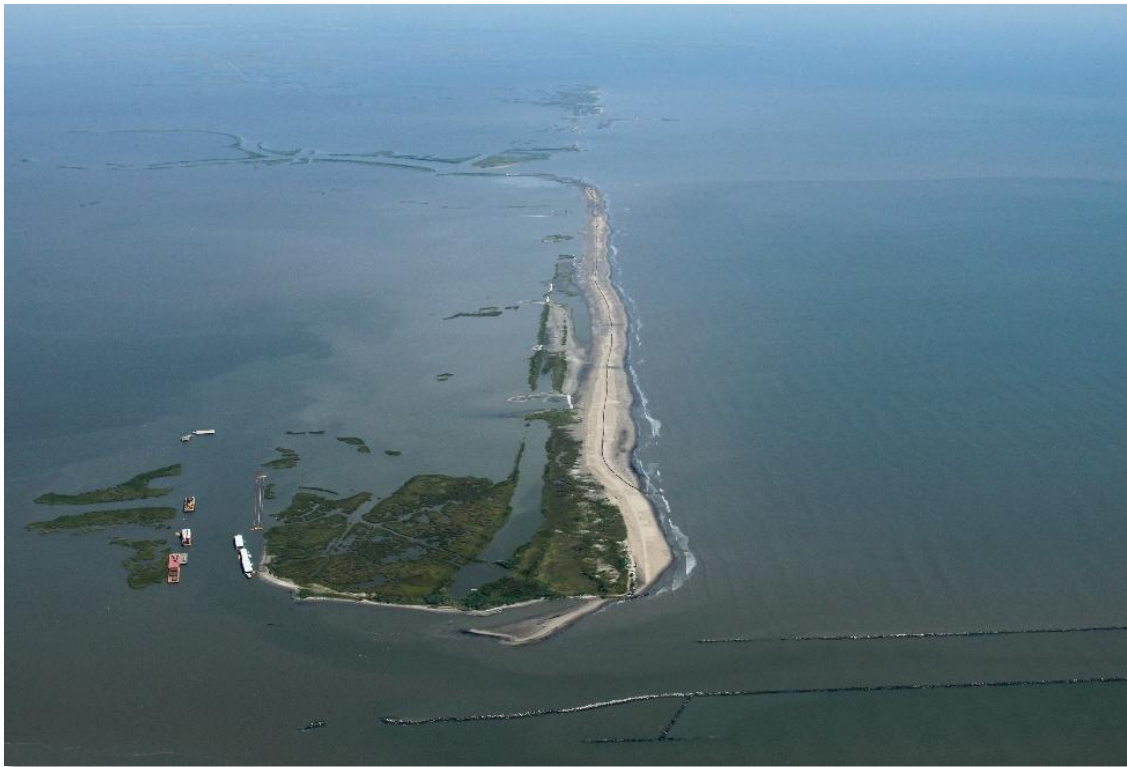
W9 Berm – September 28, 2010

Shaw Environmental & Infrastructure Group