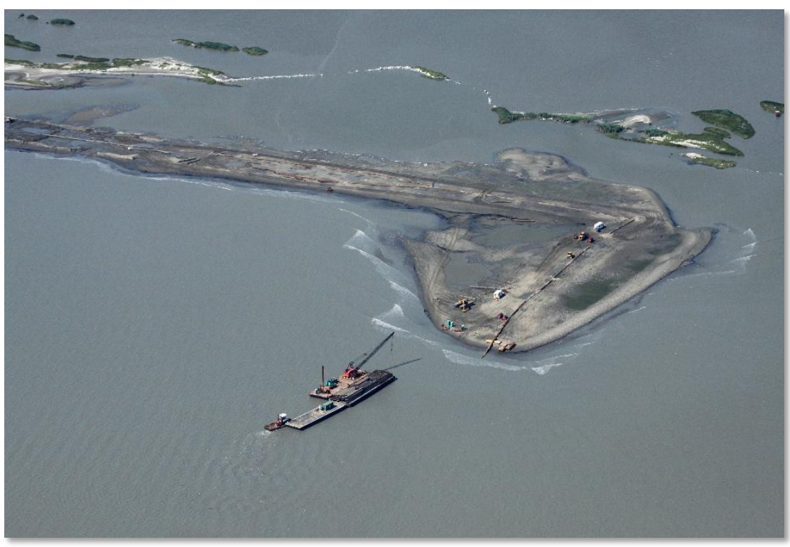
W10 Berm - September 28, 2010

Shaw Environmental & Infrastructure Group