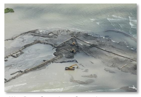
W10 Berm Operations- September 23, 2010