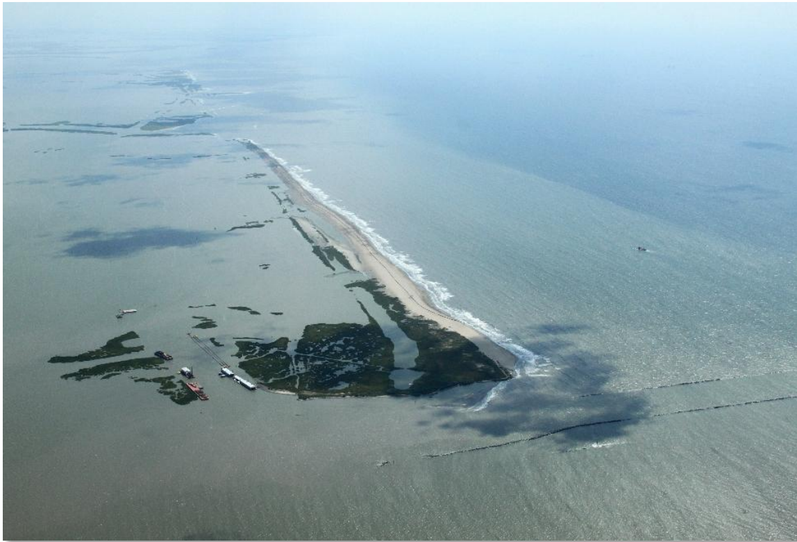
W9 Berm – September 23, 2010

Shaw Environmental & Infrastructure Group