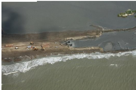
W9 Berm Operations – September 23, 2010

** Trended project completion quantities.