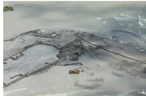
W10 Berm Operations – September 23, 2010