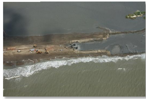
W9 Berm Operations - September 23, 2010