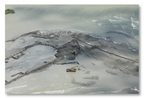
W10 Berm Operations- September 23, 2010