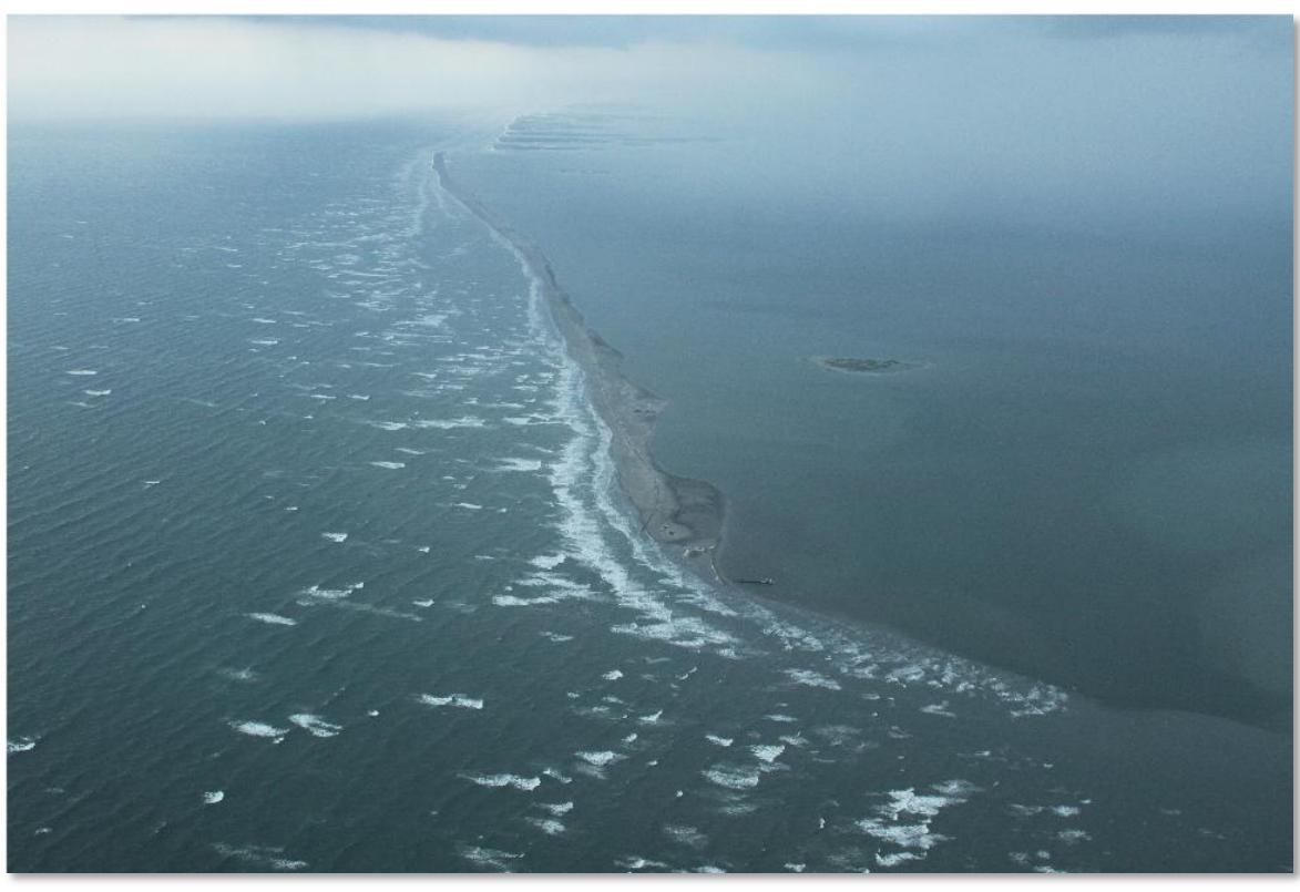
E4 North Berm - September 23, 2010

Shaw Environmental & Infrastructure Group