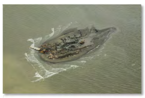
W10 Berm Initial Pad- September 19, 2010