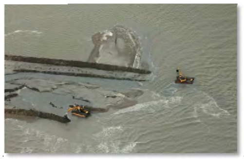
W9 Berm Operations – September 19, 2010

** Trended project completion quantities.