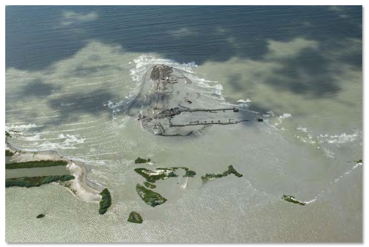
W10 Berm - September 23, 2010

Prepared by: Shaw Environmental & Infrastructure Group