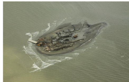
W10 Berm Initial Pad – September 19, 2010