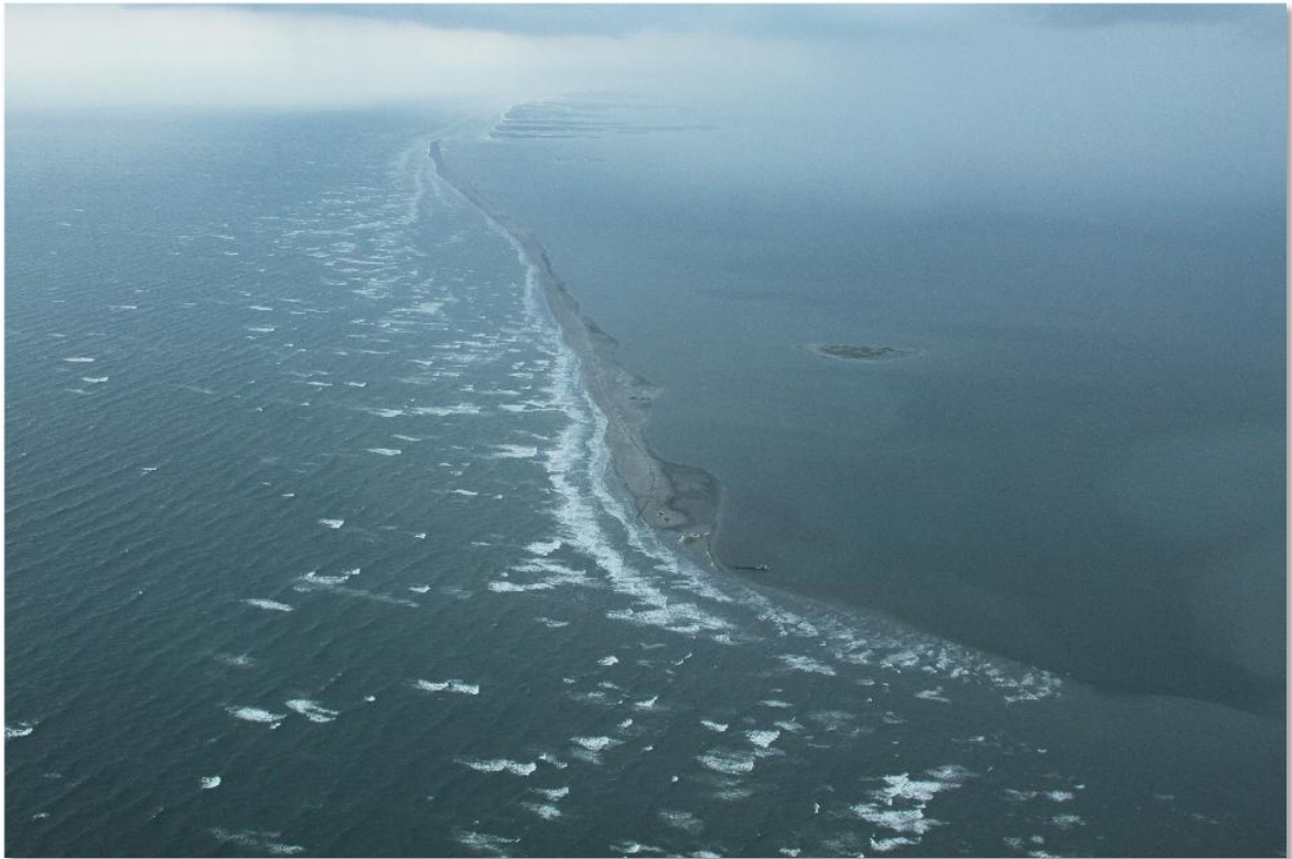
E4 North Berm – September 23, 2010

Shaw Environmental & Infrastructure Group