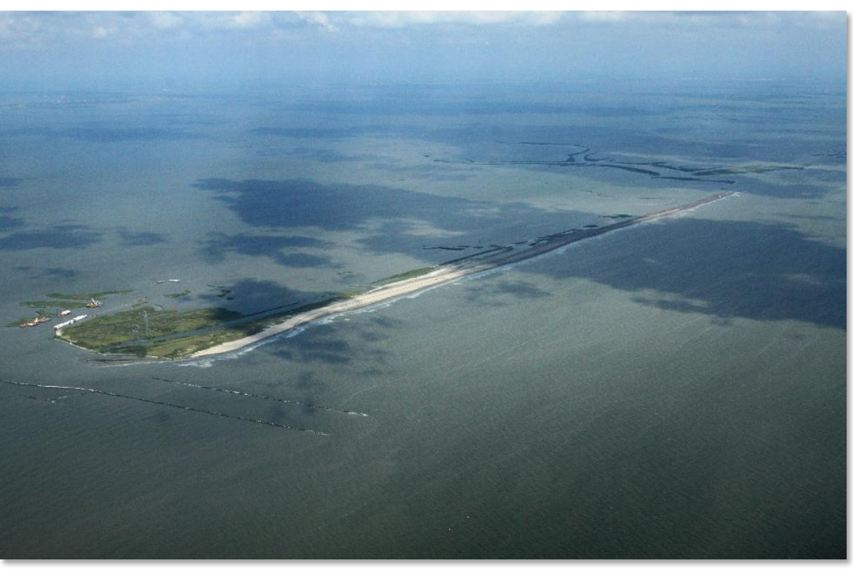
W9 Berm - September 21, 2010

Shaw Environmental & Infrastructure Group