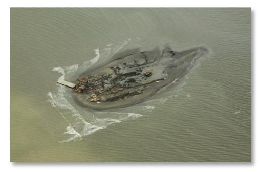
W10 Berm Initial Pad- September 19, 2010