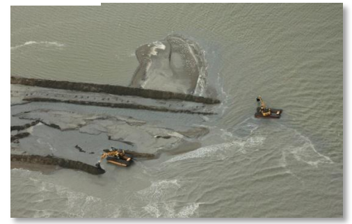
W9 Berm Operations - September 19, 2010