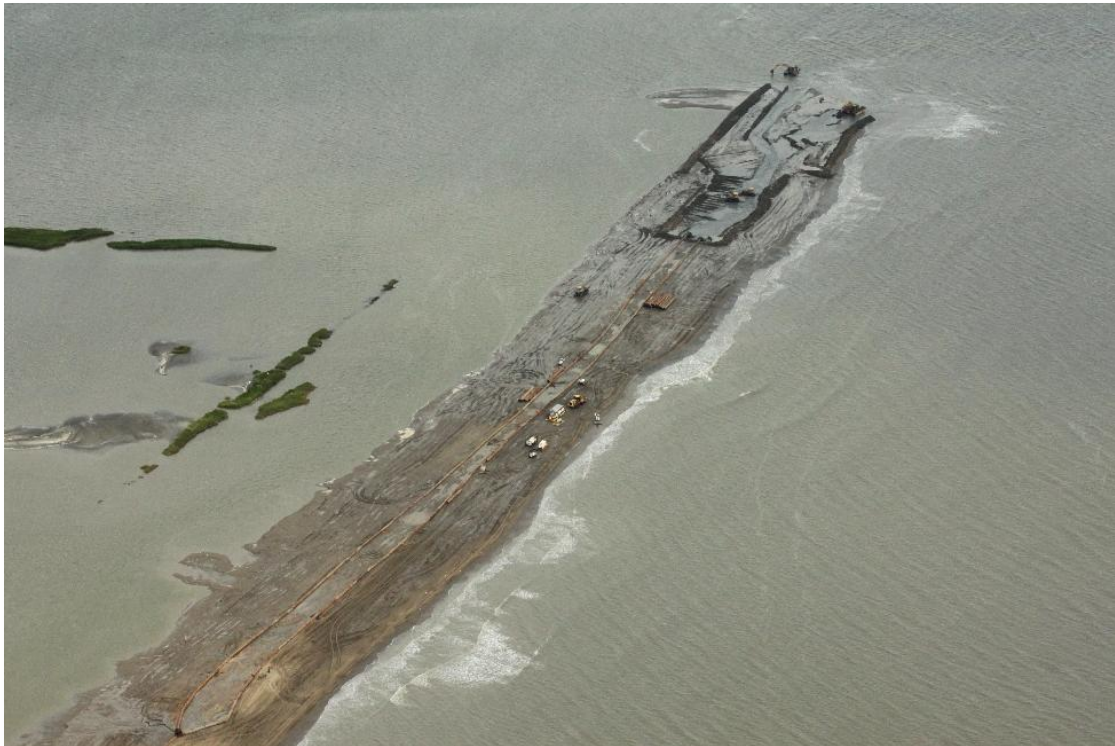
W9 Berm – September 19, 2010

Shaw Environmental & Infrastructure Group