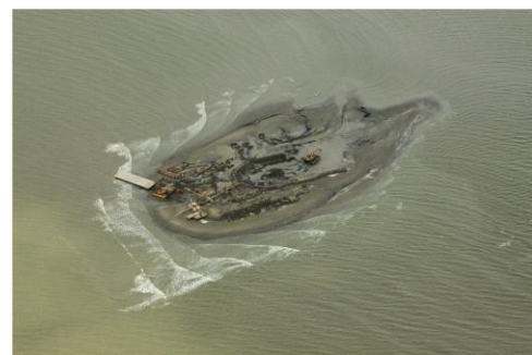
W10 Berm Initial Pad– September 19, 2010