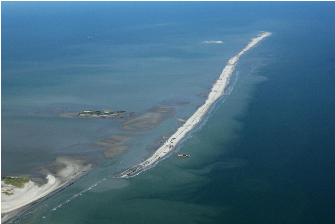
E4 North Berm – September 14, 2010

Shaw Environmental & Infrastructure Group