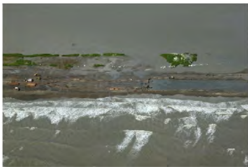
W9 Berm Operations – September 13, 2010

** Trended project completion quantities.