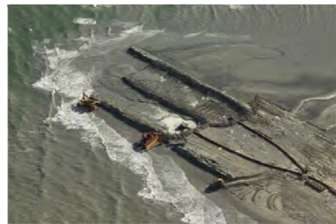
E4 North Berm – September 13, 2010