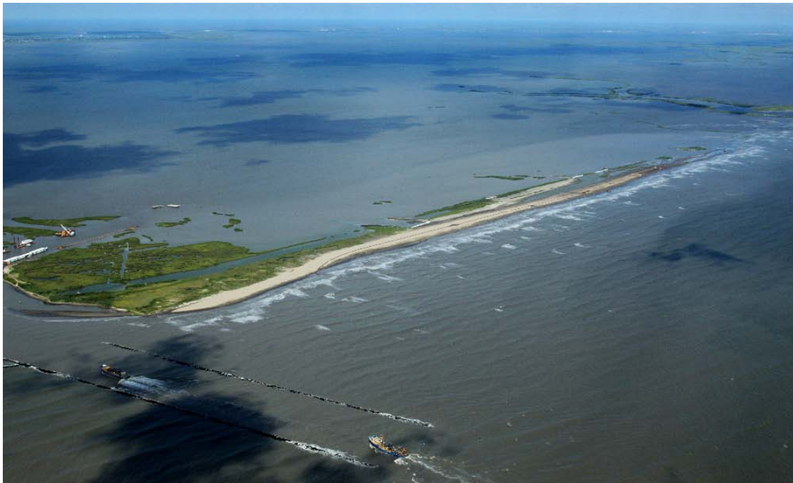
W9 Berm – September 13, 2010

Shaw Environmental & Infrastructure Group