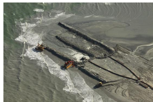
E4 North Berm – September 13, 2010