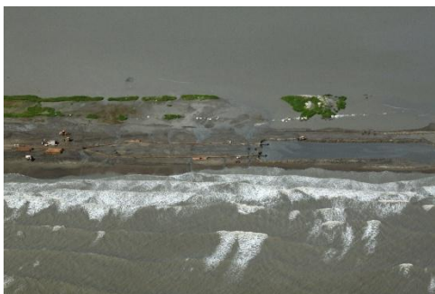
W9 Berm Operations – September 13, 2010

** Revised quantities based on project change control program.