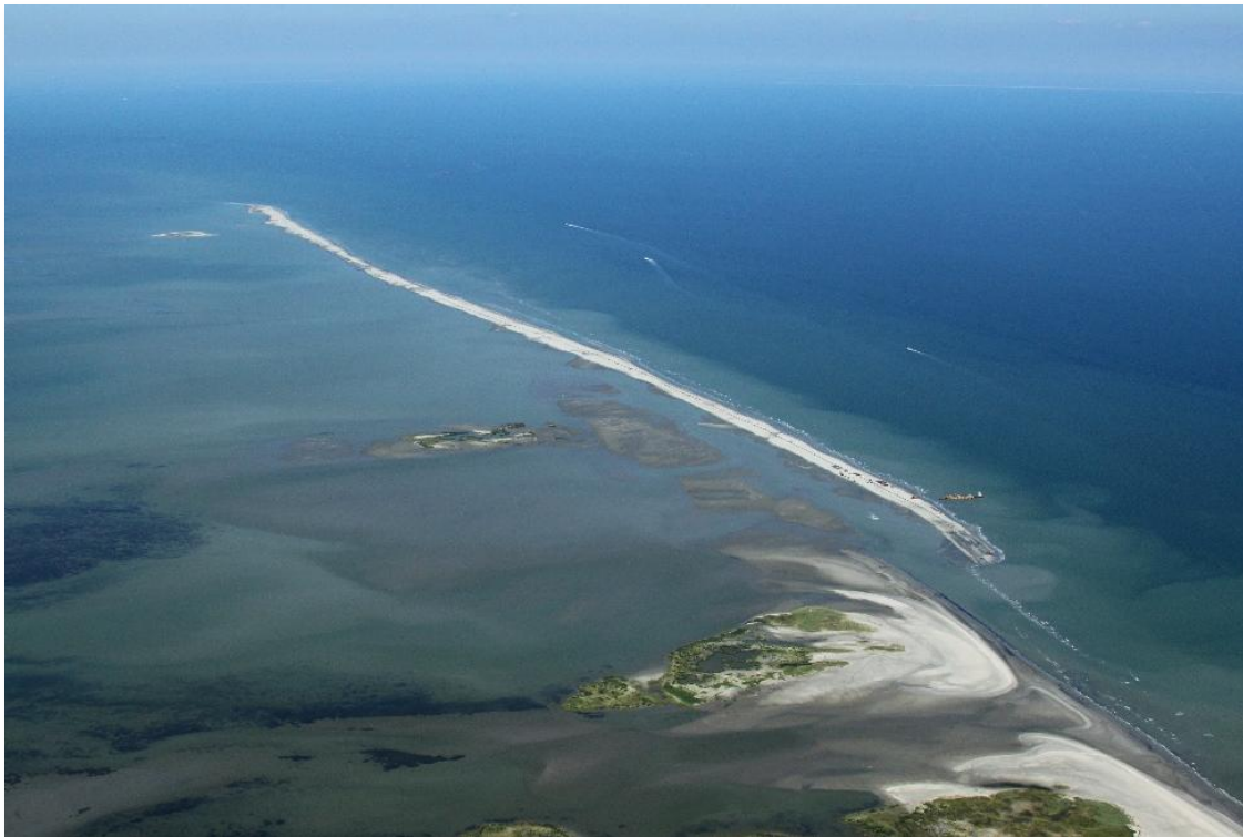
E4 North Berm – September 14, 2010

Shaw Environmental & Infrastructure Group