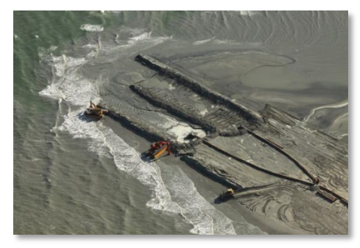
E4 North Berm - September 13, 2010