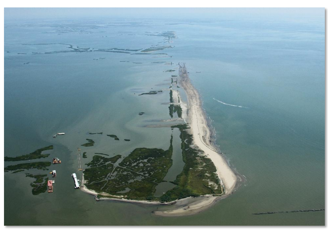
W9 Berm - September 14, 2010

Shaw Environmental & Infrastructure Group