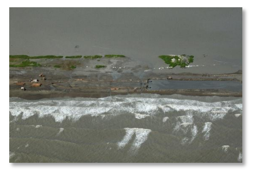
W9 Berm Operations - September 13, 2010