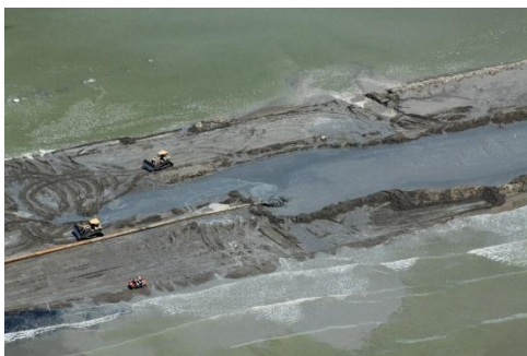
W9 Berm Operations – September 9, 2010

** Revised quantities based on project change control program.