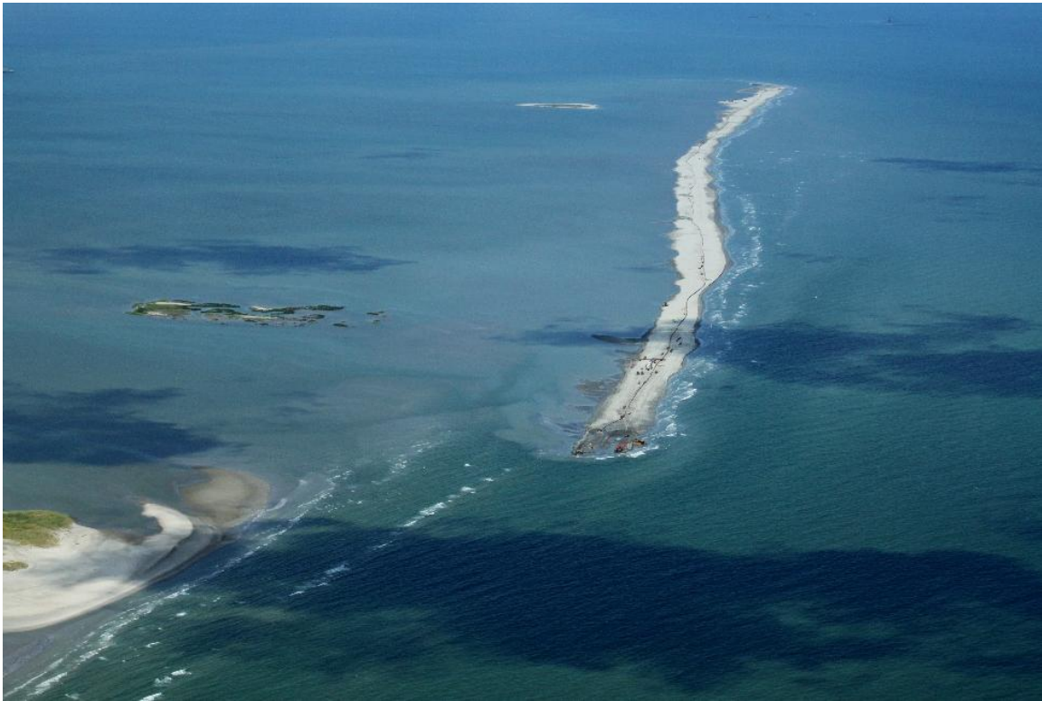
E4 North Berm – September 9, 2010

Prepared by: Shaw Environmental & Infrastructure Group