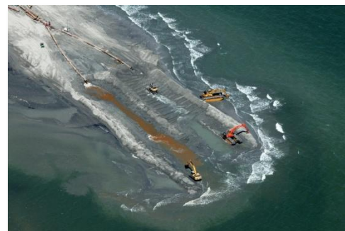
E4 North Berm – September 9, 2010