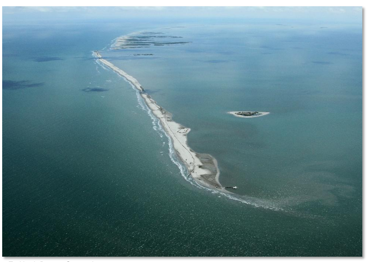
E4 North Berm - September 9, 2010

Shaw Environmental & Infrastructure Group