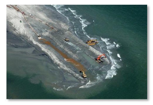
E4 North Berm - September 9, 2010