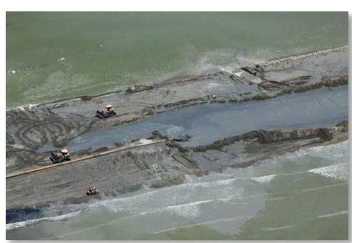
W9 Berm Operations - September 9, 2010