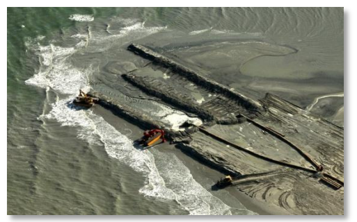
E4 North Berm – September 7, 2010