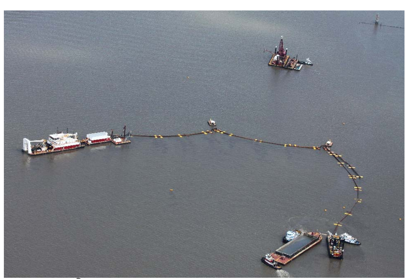
Pass A Loutre-July 27<sup>th</sup>, 2010

Shaw Environmental & Infrastructure Group