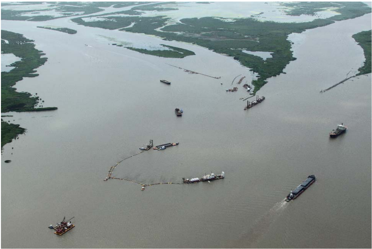
Pass A Loutre Aerial Photo - July 27, 2010

Note: Percent complete of material handled represents only 1 of 3 elements of percent complete for the overall project.