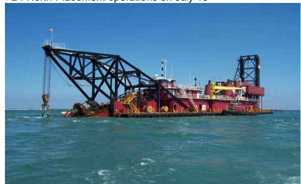
*Cutter Dredge Alaska