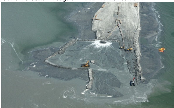
*Berm Placement at E4