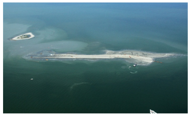
*E4 North Placement operations on July 15 th