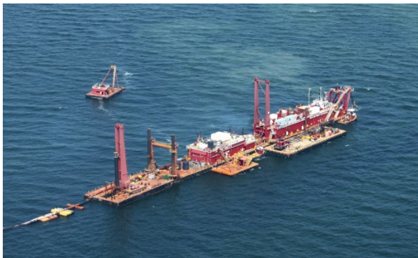
*California Cutter Dredge at E4 North / Hewes Point