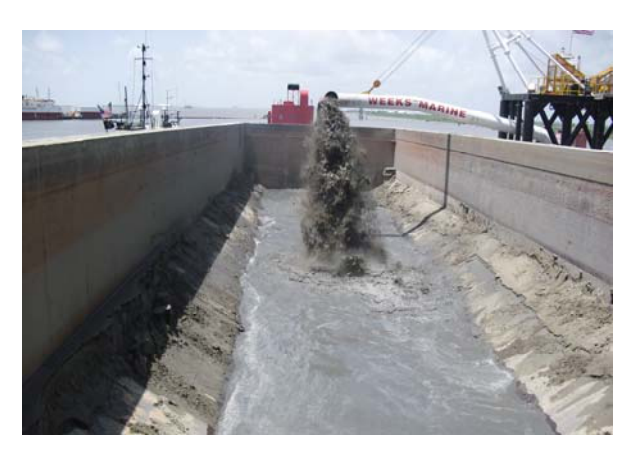
*Pass a Loutre Borrow Operations