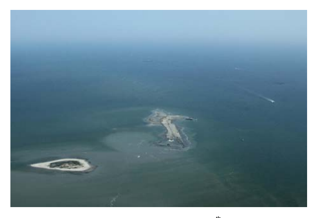
*E4 North Placement operations on July 15<sup>th</sup>