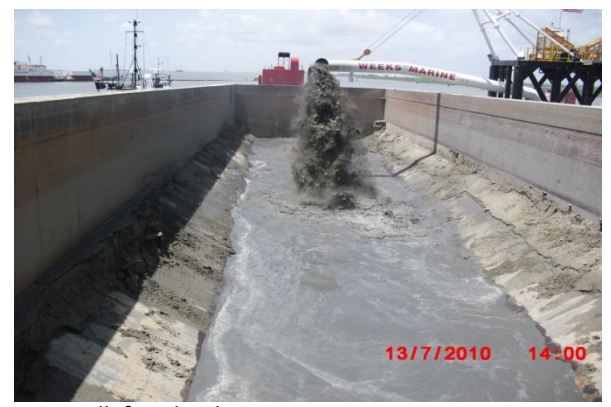
EW Ellefsen loading scow