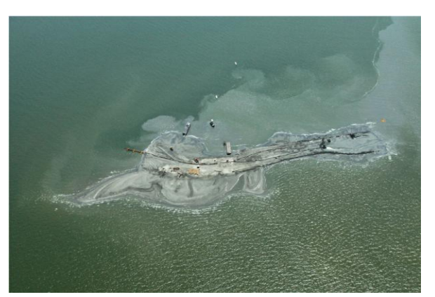
E4 Berm Aerial as of 7/13/10