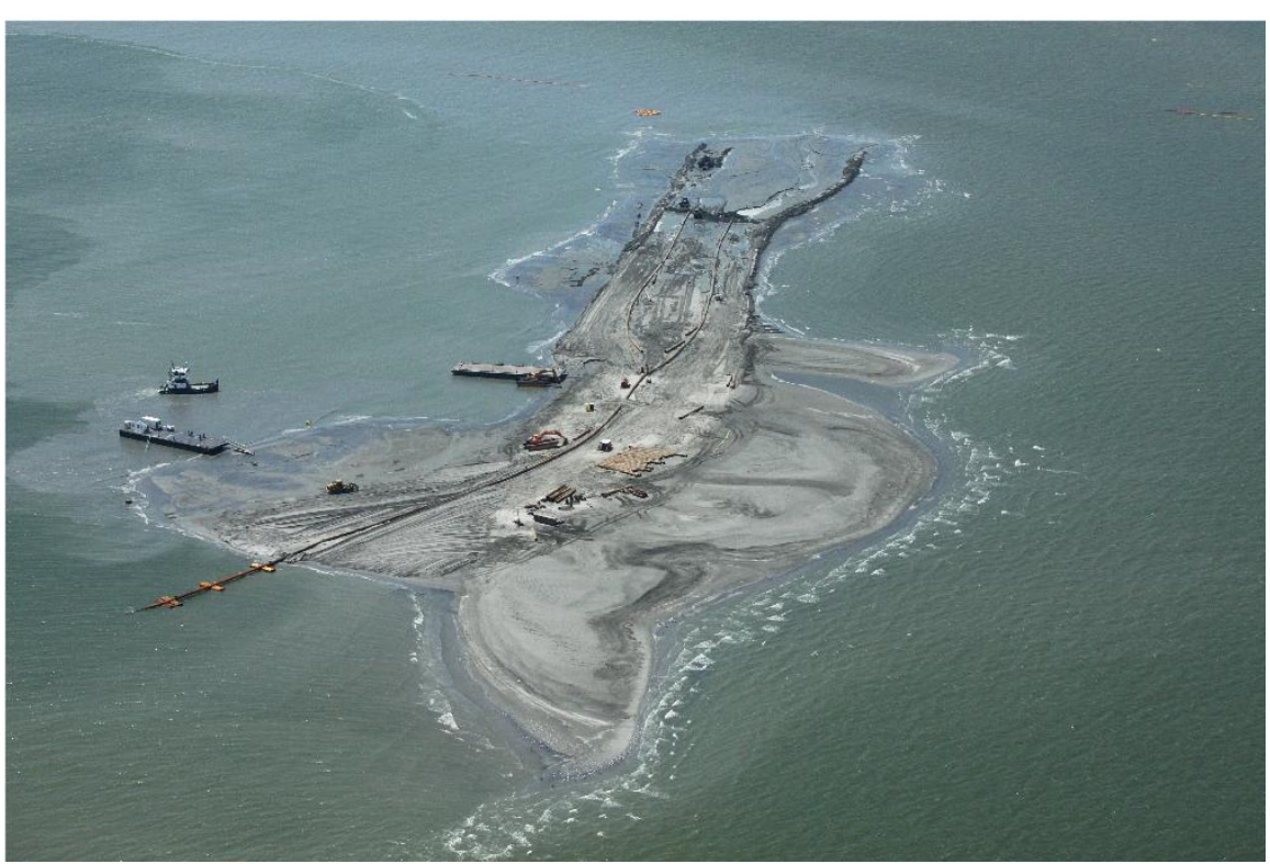
E4 Berm Construction - July 13, 2010