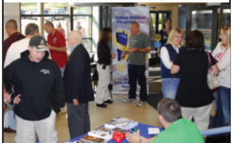
Pictured above: Returned Civil Engineering members receive information during a Yellow Ribbon event at St. Scholastica.

Visit our webpage www.148fw.ang.af.mil for more on this story