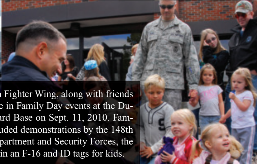
Members of the 148th Fighter Wing, along with friends and family, participate in Family Day events at the Duluth Air National Guard Base on Sept. 11, 2010. Family Day activities included demonstrations by the 148th Fighter Wing Fire Department and Security Forces, the Zoomobile, photos in an F-16 and ID tags for kids.