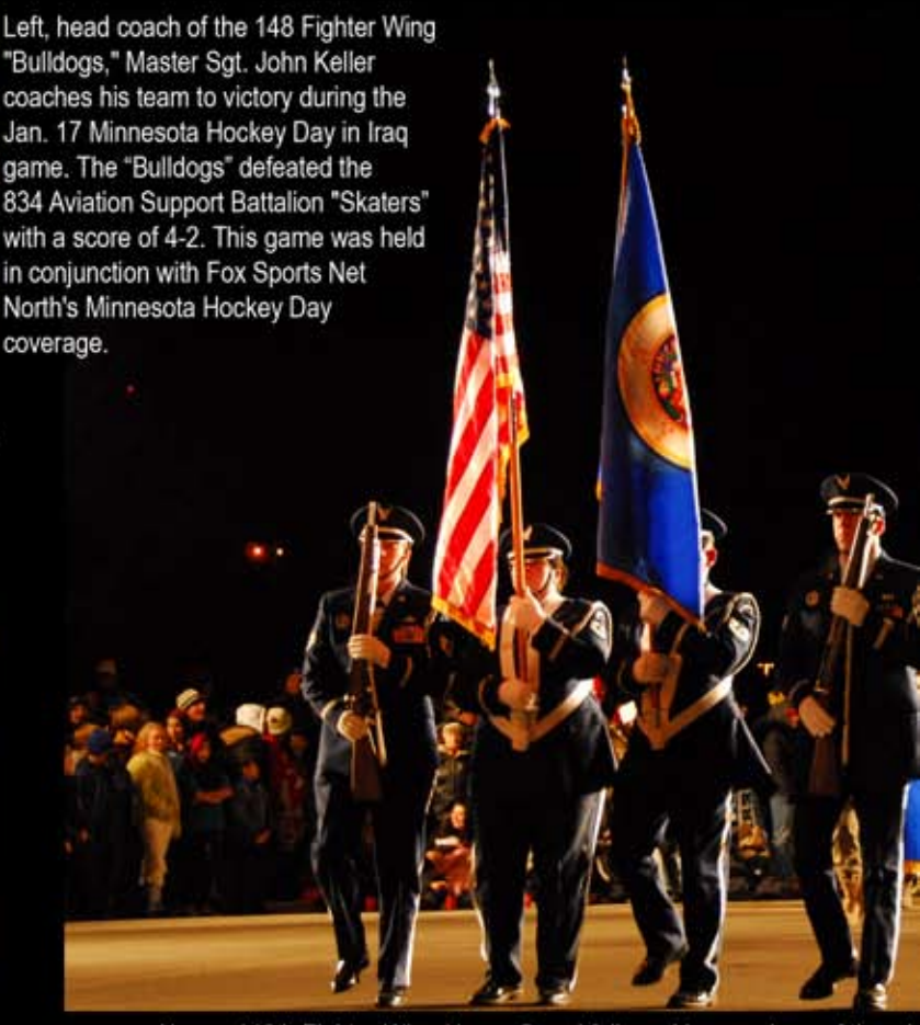
Above, 148th Fighter Wing Honor Guard followed by members of the wir Duluth, Minn. Nov. 21, 2008. The Christmas City of the North Parade dat kick off the holiday season in the Northland and has been held every year.