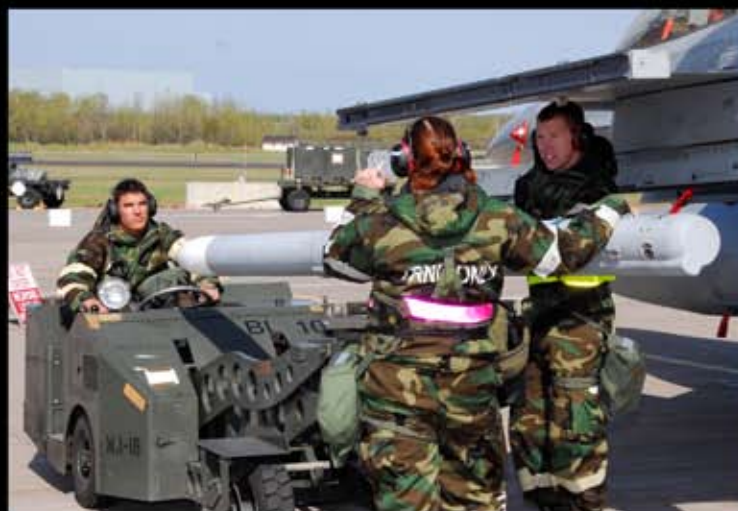
Above, munitions specialists load a training missile onto an F-16C Fighting Falcon during the May ORE.