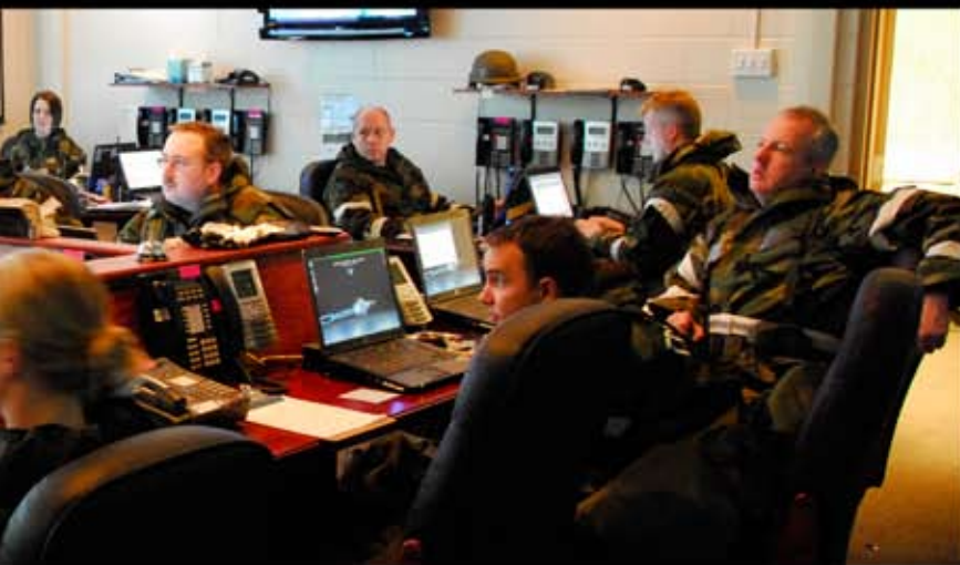
Below, the new state of the art Emergency Operation Center (EOC) and its members plays an integral part of the communications chain during the May ORE.