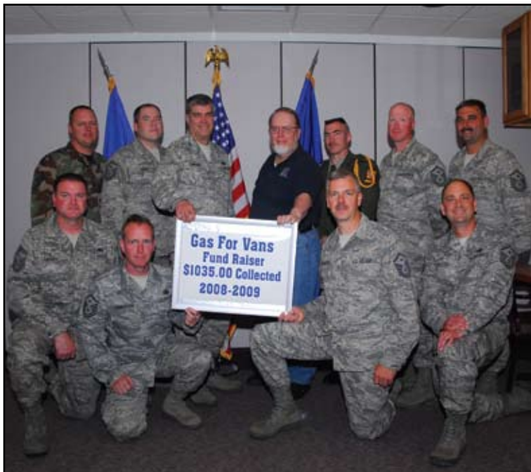
148th Fighter Wing First Sergeant's Council presents a check to the Gas for Vans program.

The 148th First Sergeants Council raised $1,035 for the Gas-For-Vans Fundraiser in a base-wide fundraising drive which started back in November 2008. The funds raised were converted into prepaid gas cards and donated to the Military Assistance Council for Veterans (MACV) Duluth and Duluth's Combined