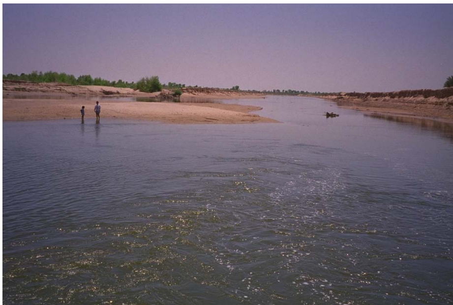
Figure 2. Photo of the Colorado River in Mexico. The extensive use of its waters for agriculture and urban water supplies throughout the Southwest reduce it to a trickling stream by the time it reaches the sea.

In the near to medium term it is hard to imagine entire communities of Geodesic Domes springing up in the desert. Thus, this scenario would most likely result in low-density communities, heavily dependent upon individual automobiles for transportation. Local shops and businesses would depend upon trucking more than trains for their freight needs. Vehicle miles