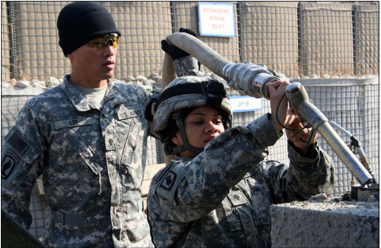
Paratroopers from the 173rd Brigade Combat Team (Airborne) top off the tank of a fork lift Feb. 8 at the Forward Operating Base Fenty refueling point.