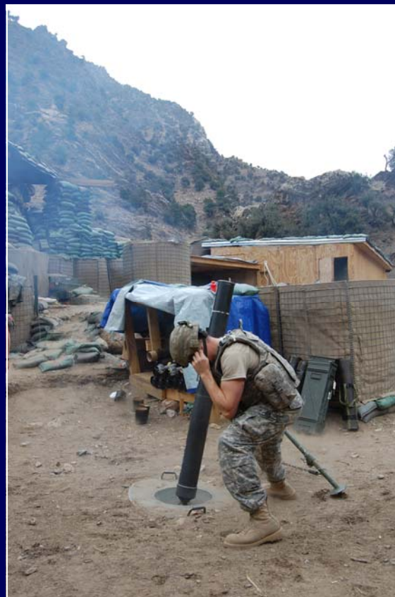
(Right) Soldiers from Chosen Company, 2nd Battalion, 503rd Infantry launch mortars at an enemy position near Observation Post Bella in Nuristan Province, Afghanistan.