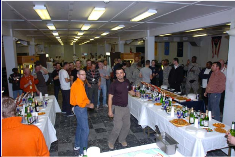
Kosovars celebrate their independence in the Jalalabad Airfield dining facility in February. Many of the dining facility workers there are from Kosovo.