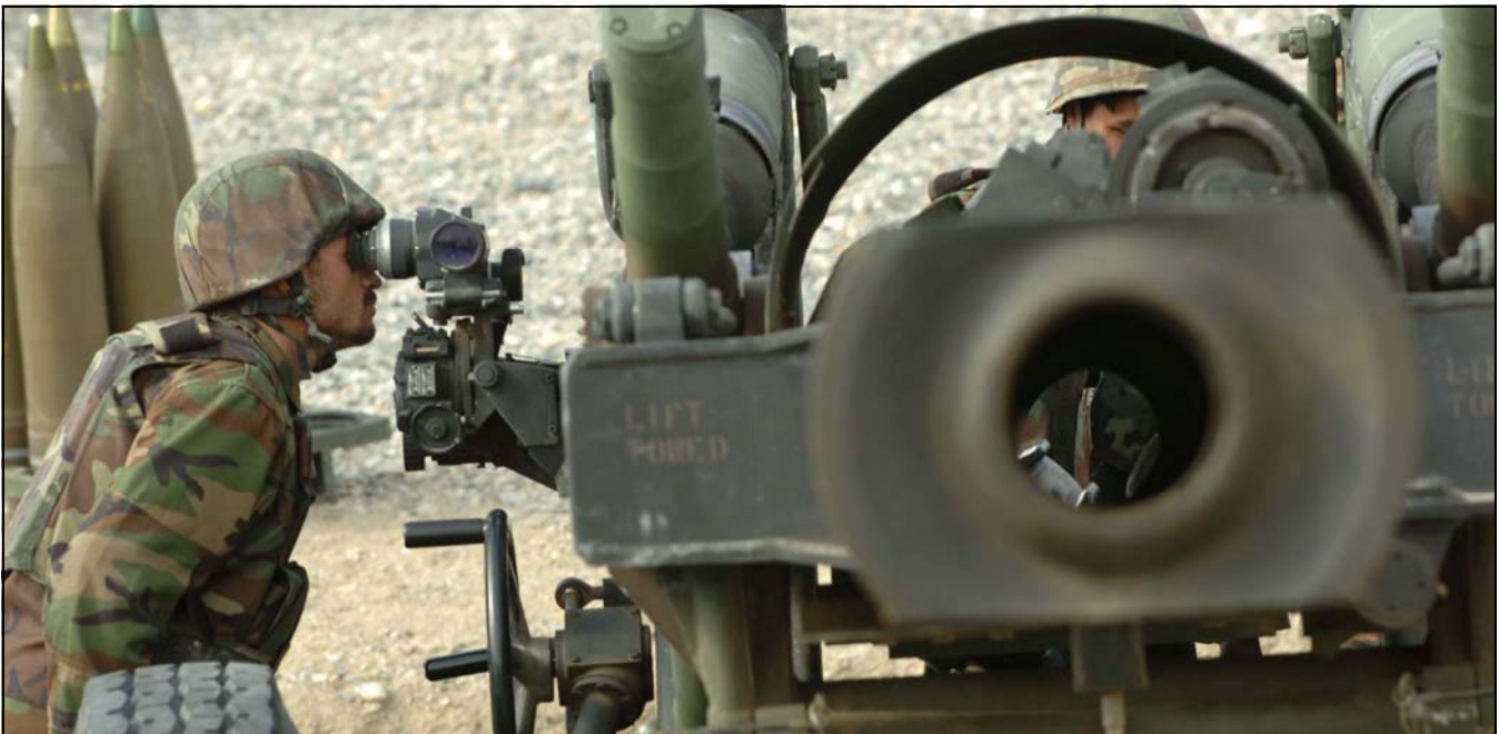
An Afghanistan National Army artilleryman looks through the sight lenses of the M198 Howitzer while receiving training on its operation from U.S. Army artillerymen from 2nd Platoon, Alpha Battery, 4th Battalion, 319th Airborne Field Artillery Regiment Jan. 28 at Forward Operating Base Kalagush in Nuristan Province, Afghanistan.