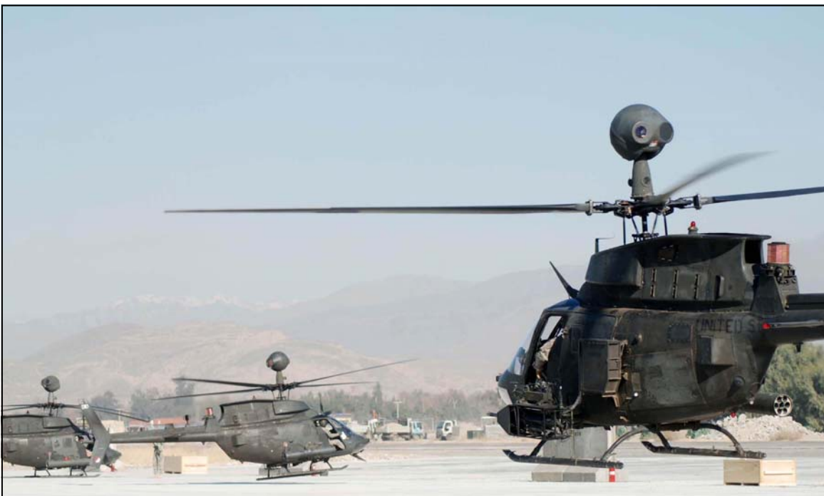
An OH-58 D Kiowa Warrior returns to Jalalabad Airfield, Afghanistan, after completing an aerial-surveillance mission. The Kiowa Warrior is a new asset to the area, brought into theater by Task Force Out Front from the 101st Combat Aviation Brigade.

"They won't have to waste a lot of time and energy worrying about the infrastructure. They will be able to conduct phase maintenance here because they'll have the proper space and tools, instead of having to send aircraft back to Bagram. Operationally, we want to be flexible enough and adapt over the course of the deployment to pose a challenge to the enemy and make them react in ways they did not want to. If we can do that, we absolutely will help the ground-force commander here to be suc-