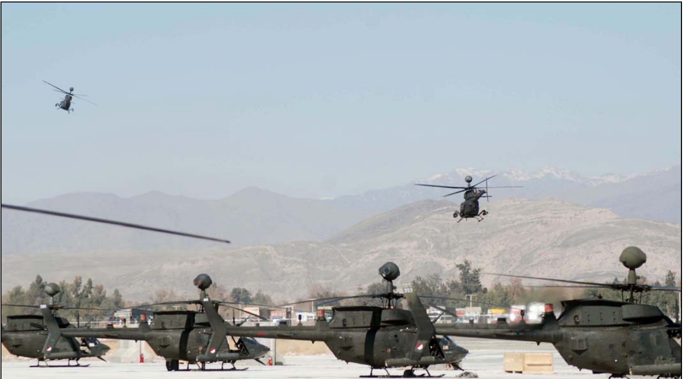
OH-58 D Kiowa Warriors sit the flightline at Jalalabad Airfield, Afghanistan, as two more depart for a mission. The helicopter, an observation and light-attack platform, is being used for the first time in the Jalalabad area of operations.