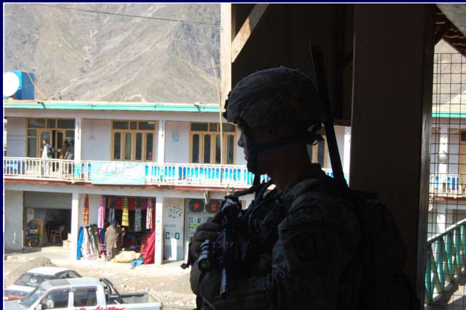
(Right) A paratrooper from Chosen Company, 2nd Battalion, 503rd Infantry pulls security in the village of Nangalam while Chosen Company leaders conduct a meeting with Namgalam officials.