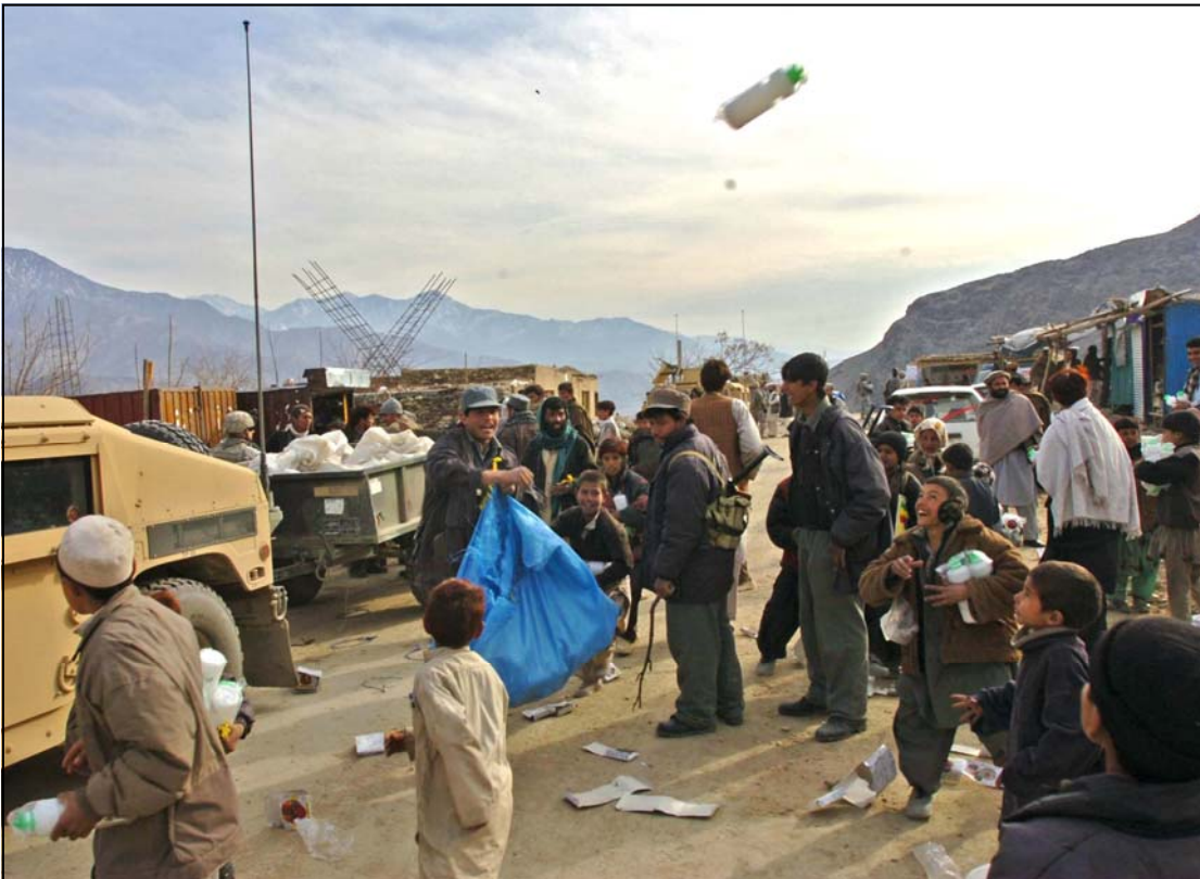
A Nurgaram District Afghan National Policeman has some fun distributing the last remaining items of material aid during an ANP led mission conducted Jan. 27 in Nuristan Province, Afghanistan. The mission was conducted with the Nuristan Provincial Reconstruction Team and Soldiers of 1st Battalion, 158th Infantry.