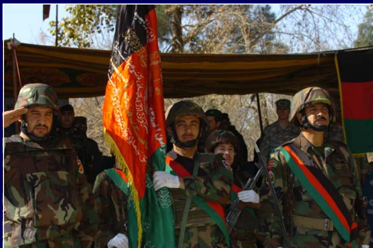
(Above) Members of an Afghan National Army color guard render honors during a transfer of authority ceremony conducted in Jalalabad, Afghanistan.