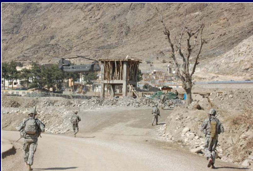
A CH-47 helicopter lifts off from Camp Blessing, Afghanistan with a sling load of supplies bound for outlying Task Rock outposts. Soldier from Chosen Company, 2nd Battalion, 503rd Infantry conduct a foot patrol in the foreground.