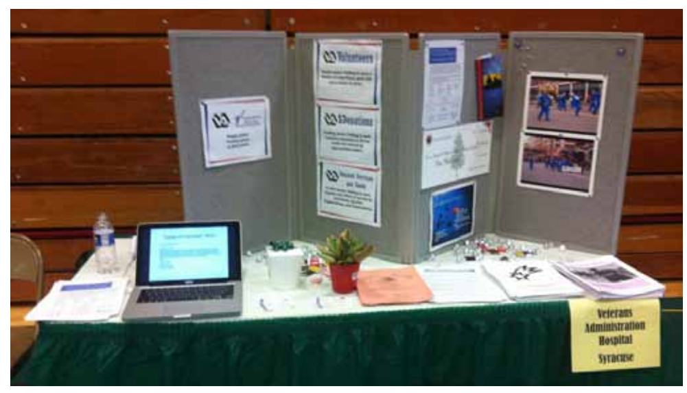
Syracuse VA participated in a Youth Volunteer Recruitment Fair at Marcellus High School.

Syracuse Voluntary Service participated in Volunteer Fairs over the past few months. Every year the Voluntary Service office has an active recruitment program with local middle schools and high schools. Many of the students recruited are interested in health careers after graduation. Voluntary Service has developed connections throughout the Medical Center to place students in areas that might give them an awareness of different career choices are available in a Medical Center. Many of the students return each year to participate at the Syracuse VA.