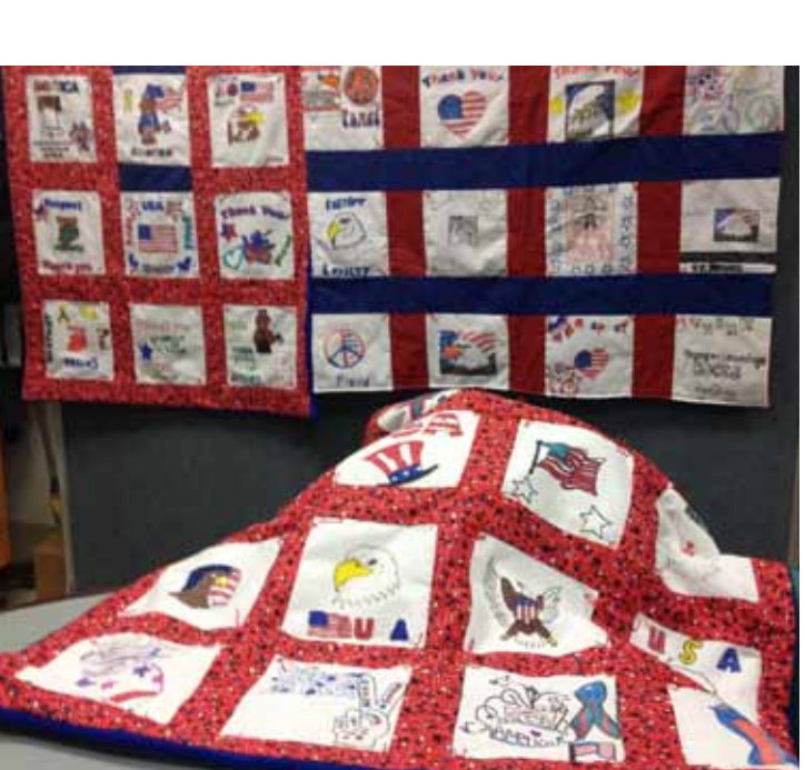
Handmade quilts have been received from a couple of local organizations. The Center for Learning in Auburn donated the handmade quilts shown in the photo. These quilts were provided to Veterans who served in the current conflicts.