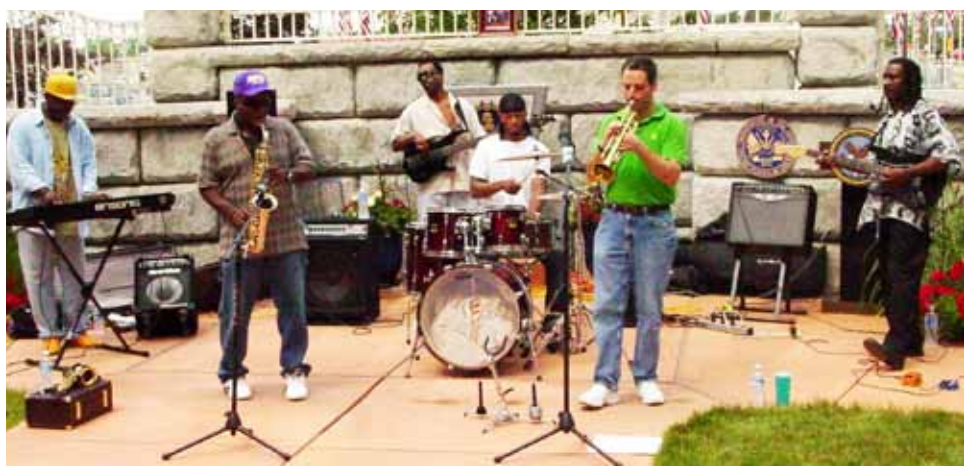
Jazz in the Park