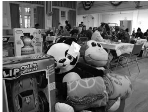
On November 20 - 21, the American Legion Auxiliary sponsored a holiday gift shop at the Canandaigua VA Medical Center. All hospitalized Veterans, as well as Veterans participating in structured outpatient programs were allowed to select gifts that were wrapped and mailed to family members or significant others at no charge.