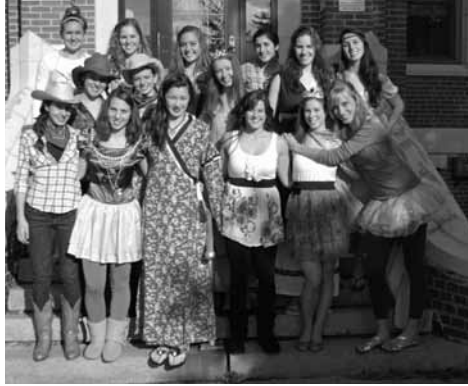
This past fall the Victor Girls Volleyball Team spent the afternoon at the Canandaigua VA Medical Center hosting a Halloween party for hospitalized Veterans.