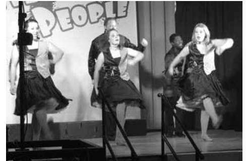
Re-Creation's "EVERYDAY PEOPLE!" show appeared at the Canandaigua VA Medical Center on October 11, bringing a new stage presentation to hospitalized Veterans and their guests.