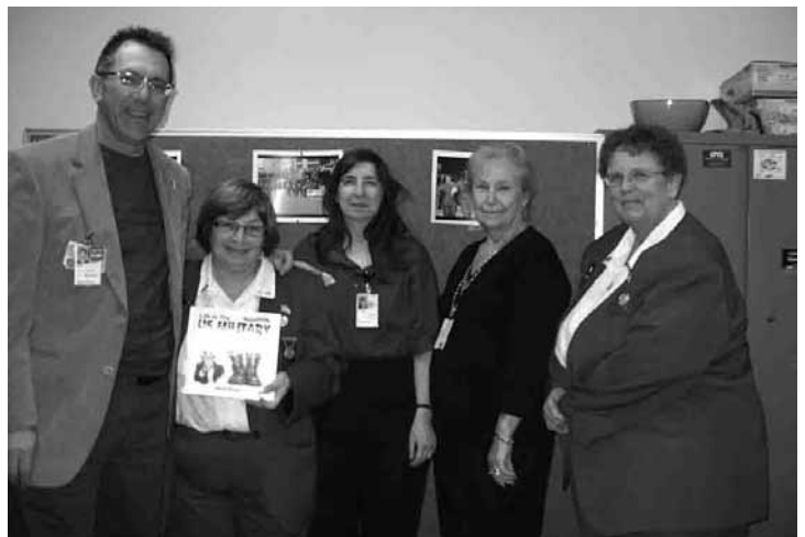
The VFW Ladies Auxiliary provided a welcome holiday visit to our facility and a lovely donation. Thank you VFW Ladies Auxiliary!

Representatives from the Syracuse City Courts arrived in December with a wonderful donation of gift bags of personal care items for the Veterans.