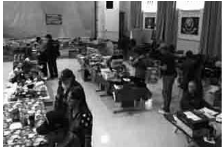
American Legion Auxiliary gift shop.