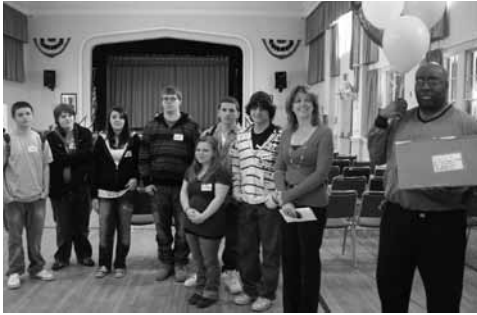
Local students assembled at the Canandaigua VA Medical Center to distribute Valentines to Veterans during the 2011 National Salute to Veteran Patients Week. This year's salute will be held February 12-18.