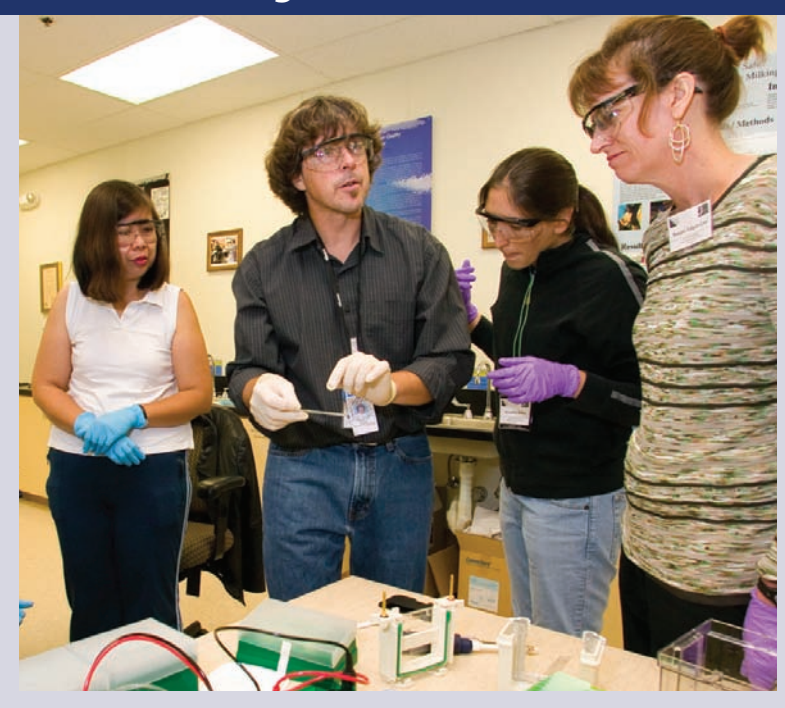
Teachers discuss a DNA lesson during a biotechnology workshop at LLNL's Teacher Research Academy last summer.

The TRA is offered during the summer months and provides workshops in three content areas: biotechnology, energy technology and the environment, and fusion-astrophysics. Each of these content areas is directly derived from the cutting-edge science conducted at LLNL. Teachers participating in the TRA workshops have an opportunity to see this science in the laboratory and meet the scientists performing the work. This experience provides teachers with a context to discuss