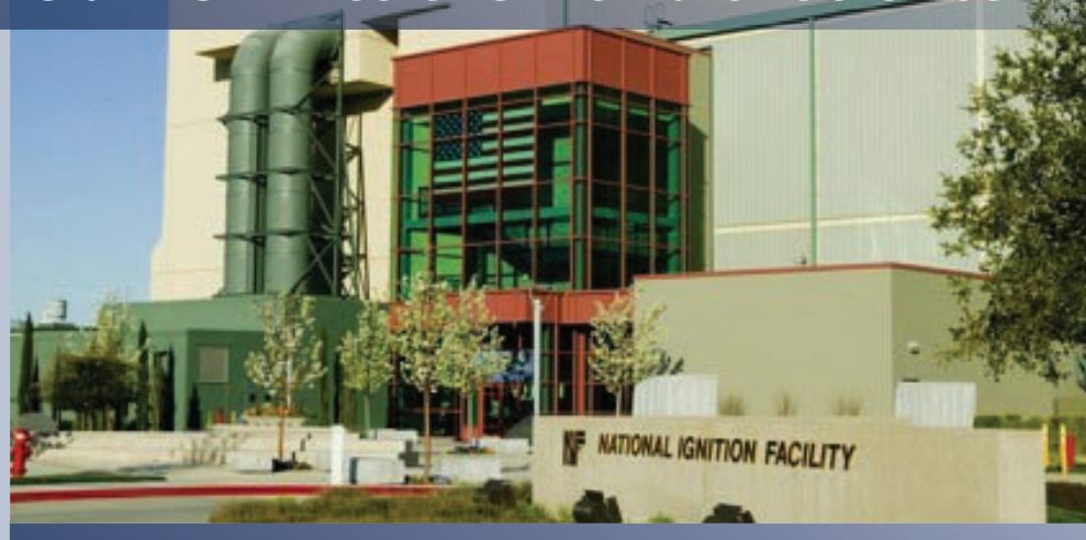
The National Ignition Facility, which houses the world's largest laser, is a favorite community tour stop.

Main site tours start and conclude at the Laboratory's Discovery Center off Greenville Road in Livermore. They are conducted on Tuesdays, excluding holidays, at 9 a.m. and last 2 to 2.5 hours. To sign up for a main site tour, go to the Web at https://www.llnl.gov/pao/community_tour_request.html or call Community & External Relations at (925) 422-4599.