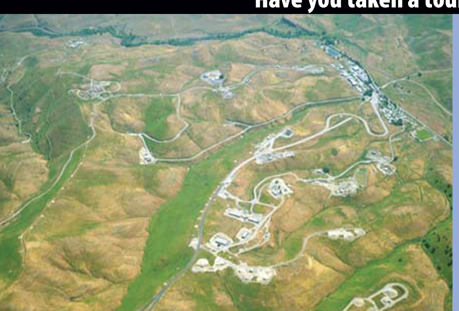
SITE 300 · LAWRENCE LIVERMORE NATIONAL LABORATORY

Community tours of Site 300 began in March. To date, more than 50 area residents have participated and provided many positive comments about their experience.