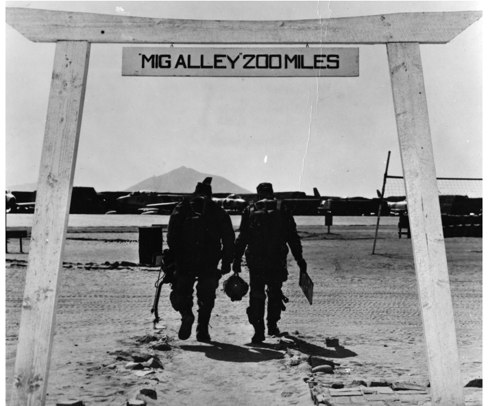
Famous photo of the torii gate leading to the Sabre flight line at Kimpo Air Base.

combat missions over North Korea in early November 1950.