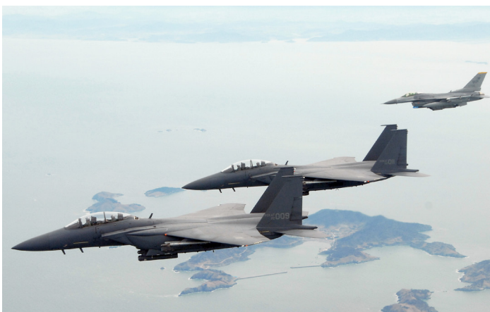
Republic of Korea Air Force F-15 fighters on a joint training mission with a USAF F-16 Fighting Falcon over South Korea.

More information and photos from the Korean War Gallery are available online at http://www.nationalmuseum.af.mil/exhibits/korea/index.asp . To plan a field trip to the museum, see http://www.nationalmuseum.af.mil/education/educators/index.asp .