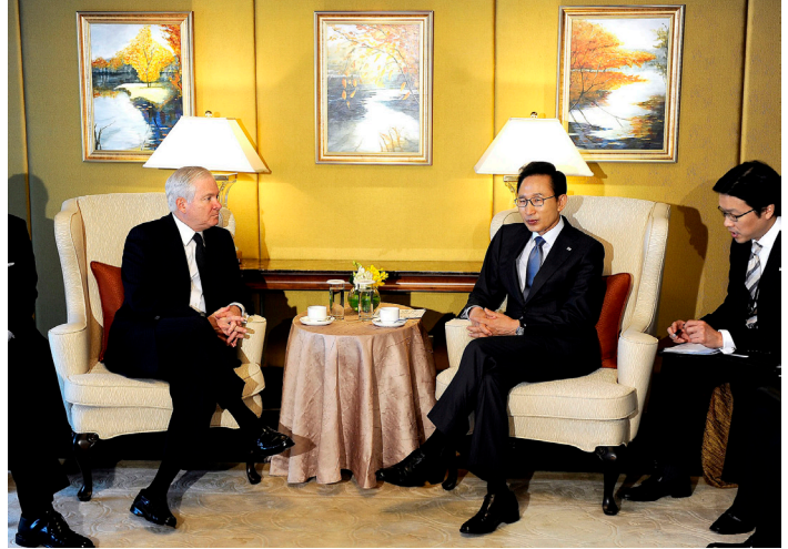
U.S. Secretary of Defense Robert M. Gates talks with Republic of Korea President Lee Myung-Bak at the 9th International Institute for Strategic Studies, June 2010.

The United States Air Force maintains a robust presence on the Korean peninsula. The 7th Air Force's 51st and 8th Fighter Wings operate from Osan and Kunsan Air Bases, with support units at several other South Korean locations. Bolstering U.S. air power in the region, Pacific Air Forces also are present in Japan, Hawaii, Guam and Alaska. Overall, the U.S. has around 28,500 service members stationed in South Korea, including about 20,000 U.S. Army Soldiers. Naval and Marine forces also play key roles in Pacific regional defense.