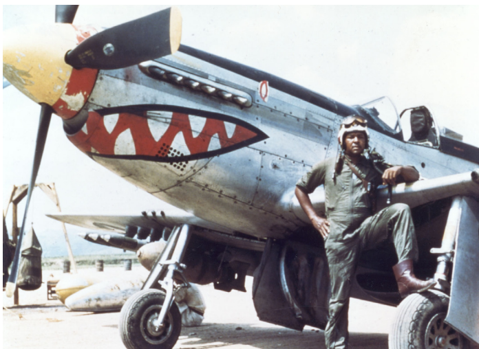
Lt. Daniel “Chappie” James in Korea. He later rose through the ranks to become the first African-American four-star general in the USAF.

Since the USAF did not have any airborne FAC units at the beginning of the war, pilots flew the first missions with borrowed Army liaison aircraft only