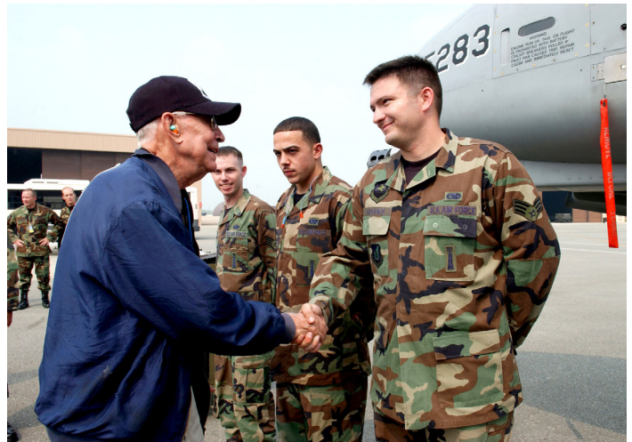
Generations connect: Air Force Korean War hero, POW and double ace Lt. Col. Harold Fischer greets 51st Fighter Wing personnel at Osan Air Base, Republic of Korea, 2007.