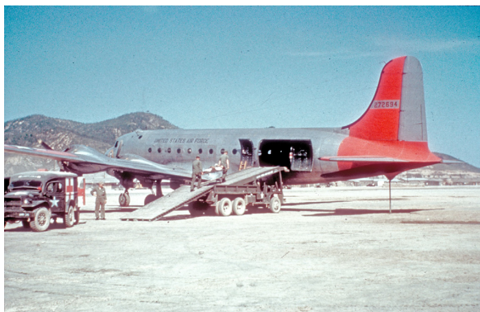
Loading casualties onto a C-54D at Taegu, 1951.

By the end of the war, Combat Cargo moved 311,673 wounded and sick personnel (some individuals were counted more than once in this figure because of more than one move). In addition to Combat Cargo's impressive evacuation record, the Military Air Transport Service (MATS) moved 43,196 casualties home to the United States. The heart of the system set up during the Korean War still exists today, with the USAF fully responsible for all aspects of military aeromedical evacuation behind the front lines.