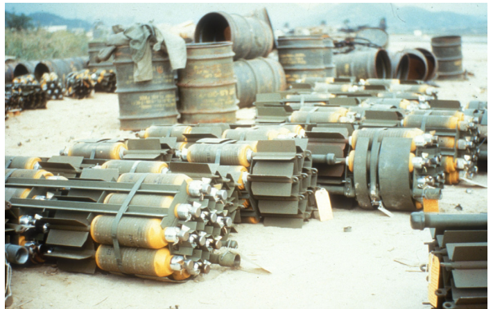
Bomb dump with several M26A1 bomb clusters. Each one scattered twenty 20-lb. fragmentation bombs as it fell. This weapon was effective against enemy troops and trucks.

A joint system of coordinating USAF, Navy and Marine ground support had its first test in Korea. Perhaps the most important element of USAF close air support was the extensive use of “Mosquito” airborne forward air controllers (FACs) and ground-based Tactical Air Control Parties (TACP). The airborne FACs