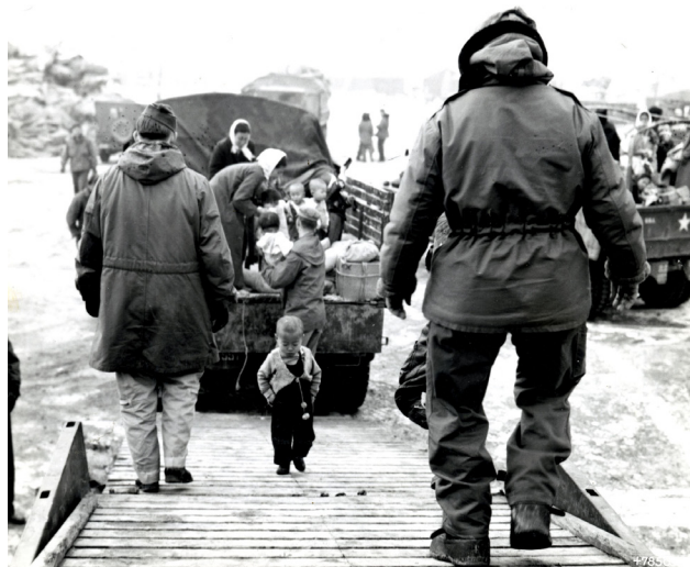
A Korean toddler climbs aboard a C-54 bound for Cheju-do.

In December 1950 Operation Kiddy Car saved the lives of 1,000 South Korean orphans by evacuating them by air from the mainland to Cheju-do, a southern island, as communist troops advanced.