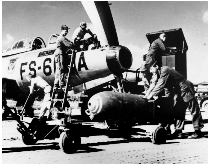
Ground crewmen from the Florida Air National Guard's 159th Fighter Squadron ready an F-84 for combat in Korea.

Reserve and Guard Airmen filled roles in every part of the USAF during the war, from combat flying in bomber, fighter, airlift, and rescue units, to all manner of ground support jobs at forward and rear bases in the Far East and elsewhere. Mobilization for Korea led to greater equality and cooperation among active duty and reserve forces because Guard and Reserve Airmen played an essential part in the young U.S. Air Force's success as a combat-tested service.