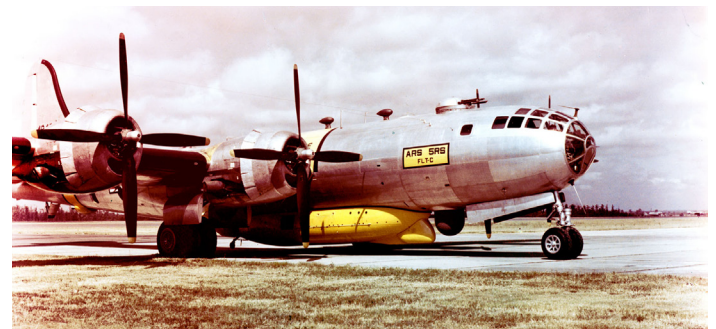
An Air Rescue Service SB-29 of the 5th Rescue Squadron with an Edo A-3 lifeboat attached.

Engine: Gas, 4-cylinder Red Wing Meteor 20