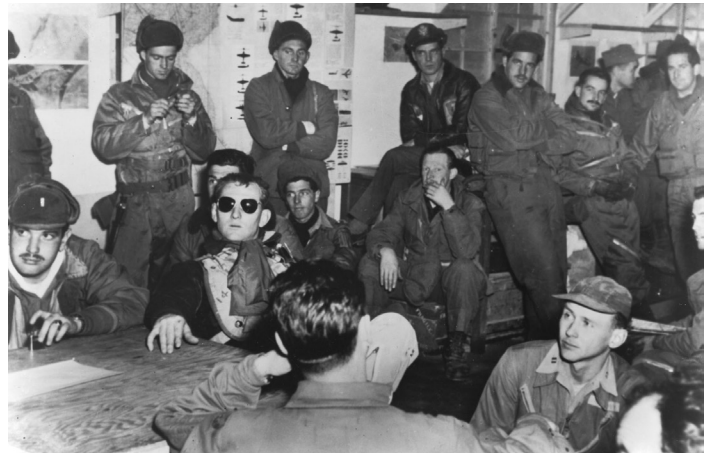
Tired USAF and Royal Australian Air Force Mustang pilots being debriefed after an attack on communist forces southeast of Seoul in February 1951.

In 1957 Hess published his story in a book entitled Battle Hymn which was made into a motion picture that starred Rock Hudson as Dean Hess. Hess’ royalties from both the book and the movie were used to construct a new orphanage near Seoul, Korea. Hess retired from the USAF as a colonel in 1969.