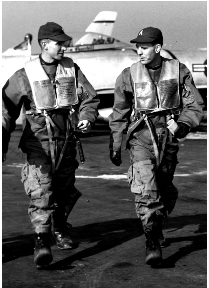
This is the type worn by fighter pilots over their G-suits, with a life preserver.

Exposure suits protected downed pilots and other air crew and passengers from freezing in the icy waters of the Yellow Sea between Korea and Japan. Fighter pilots commonly wore exposure suits while flying, since they would not have time to put one on if they had to eject from a damaged aircraft. Air crew and passengers in larger aircraft like bombers and transports had access to quick-donning exposure suits packed in highly visible yellow bags hung inside aircraft. If a plane ditched in the water, they could rapidly slip them on for protection from the elements.