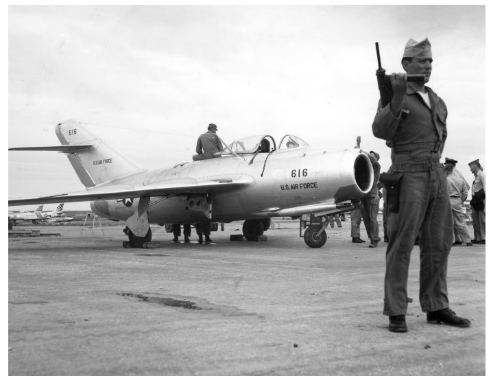
Repainted in USAF markings and insignia, the MiG-15bis under guard and awaiting flight-testing at Okinawa.