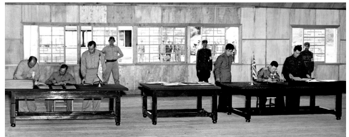
The armistice is signed.

The end of combat created the famous Demilita-