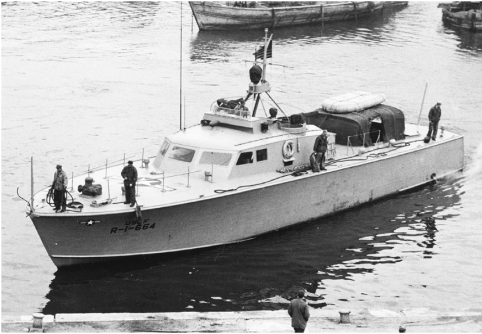
The Air Force used 85-foot crash rescue boats to insert agents in North Korea. This boat was damaged by enemy fighter aircraft near Cho-do island off the coast of North Korea.

“We started dropping people way up north. We would fly eight-hour missions in a C-47, dropping people all over.”