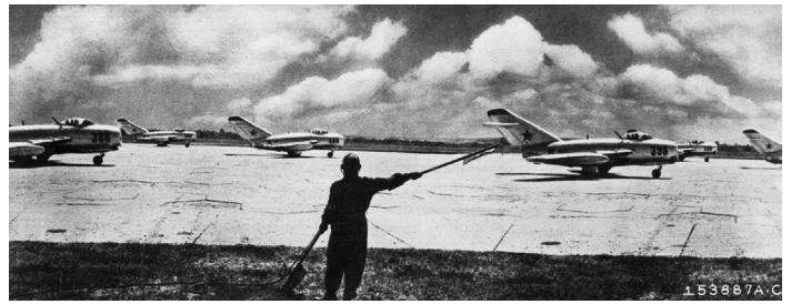
Soviet-built MiG-15 jet fighters ready for takeoff.

Before the Korean War, Soviet pilots were already in China training the newly created communist Chinese air force, or People’s Liberation Army Air Force (PLAAF). In August 1950, the USSR secretly deployed MiG-15s to Antung next to the border with North Korea. Soviet MiG-15 pilots flew their first