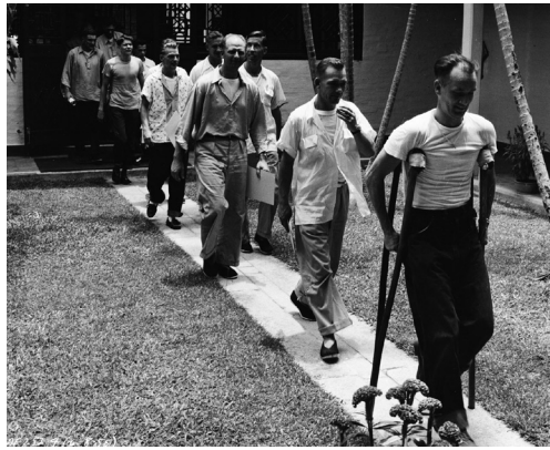
Shot down in 1953, this 11-man B-29 crew was held in China, tortured and not repatriated until late 1955.

The communists tried to sway world opinion against the UN by forcing “confessions” of atrocities against North Korea from American POWs. They also