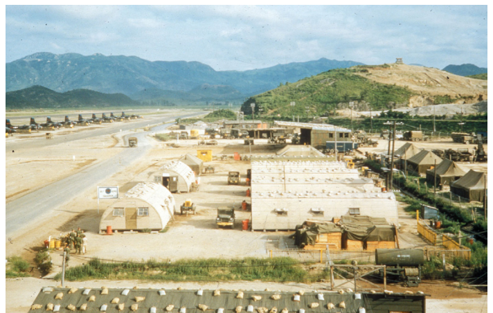
This photo of K-9 (Pusan East) in June 1953 shows a typical Korean air base at the end of the war.

There are temporary corrugated metal buildings in the middle, while on the right are tent barracks. The B-26 aircraft on the left are parked in the open, exposed to the elements.