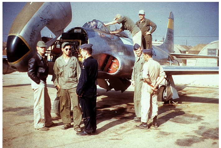
Ground crew prepare to fit the RF-80 Emma-Dee with nose cameras as reconnaissance pilots watch.