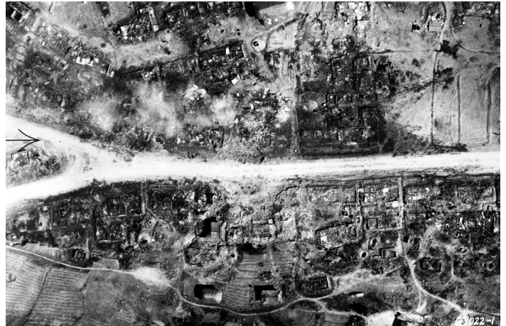
Air Force light bombers laid waste to this cluster of storage warehouses west of Pyongyang, North Korea.

Interdiction continued in the strategic “air pressure” campaign from 1952 until the signing of the armistice in 1953. The air pressure campaign was targeted to produce costly economic damage to the communists and reduced their will to continue fighting (many communist prisoners complained of inadequate supply as the biggest cause of poor morale). Perhaps more importantly, interdiction efforts during the last two years of the war prevented the enemy