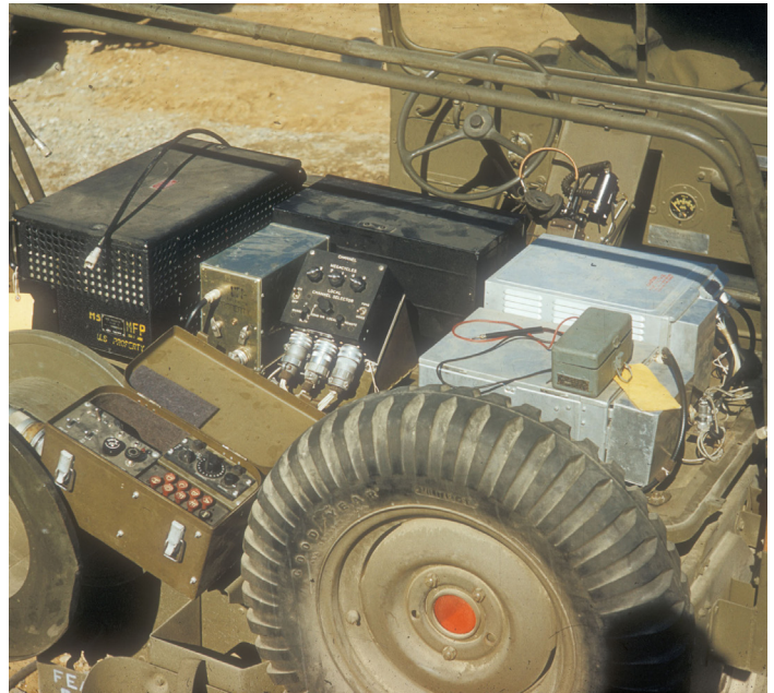
The back of a TACP jeep was filled with equipment. The types of radios used in TACP jeeps evolved over the course of the war.

incompatible radio systems). They also coordinated artillery fire with air strikes. Further, having an experienced Mosquito pilot so close at hand enabled ground commanders to effectively use air power.