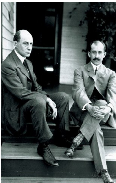
The Wright Brothers

"In the spring of the year 1899, our interest in the subject was aroused through the reading of a book on ornithology. We could not understand that there was anything about a bird that would enable it to fly that could not be built on a larger scale and used by man. At this time our thought pertained more particularly to gliding flight and soaring. If the bird's wings would sustain it in the air without use of any muscular effort we did not see why man could not be sustained by the same means. We knew that the Smithsonian Institution had been interested in some work on the problem of flight and, accordingly, on the 30th of May 1899, my brother Wilbur wrote a letter to the Smithsonian inquiring about publications on the subject."