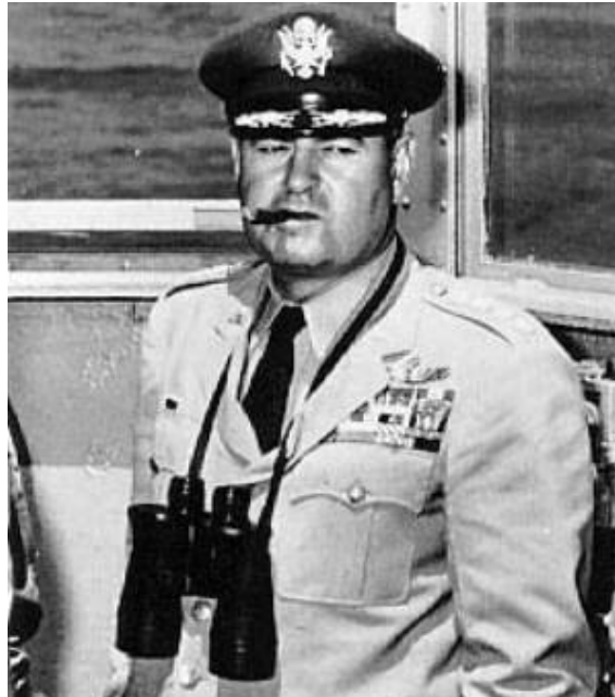
General Curtis LeMay

Curtis Emerson LeMay has been called the father of modern strategic bombing and is considered to be one of America's most famous air commanders. The Columbus native attended Columbus public schools and The Ohio State University, graduating with a bachelor's degree in civil engineering. In 1928 he entered the Armed Services as a flying cadet. He completed pilot training at Kelly Field, Texas, and was commissioned a second lieutenant in the Air Corps Reserve in October 1929. He received a regular commission on Feb. 1, 1930.