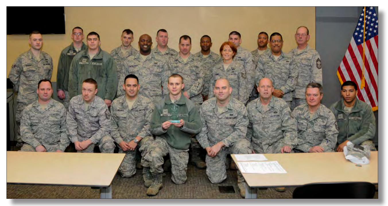
The 108th Civil Engineer Squadron Base Recovery Team accepts Jan. 13, 2013, the Fiscal Year 2013 1st Quarter Safety Award for their efforts during Hurricane Sandy. Each mem-