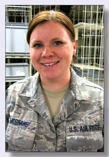
"I didn't make one for this year."