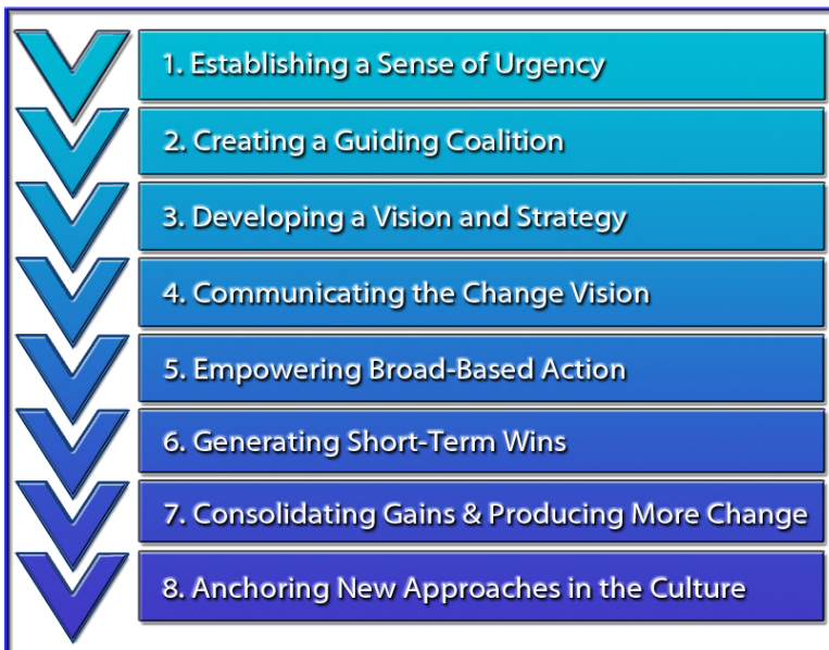
Figure 1. Kotter's Eight Steps of Change

Author John Kotter does an excellent job outlining eight essential steps for creating organizational change. Figure 1 shows these key steps.