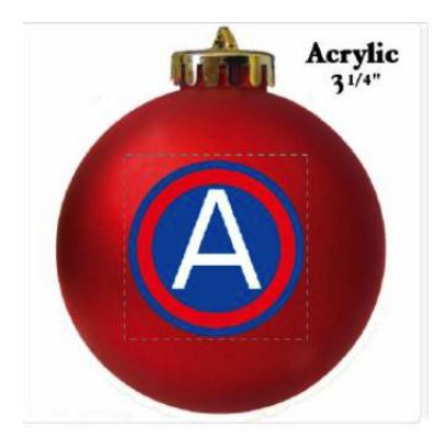
3<sup>rd</sup> Army Ornaments $10 Shatterproof Ornament 3-1/4"