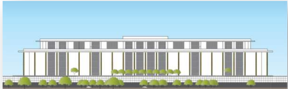
Existing River Terrace Elevation

This provides a basis for evaluating the impacts of the action alternatives.