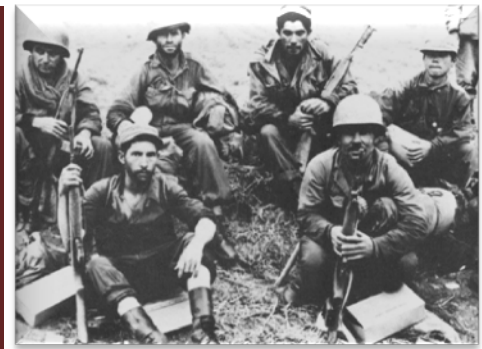
Above: Soldiers of the 65th Infantry Regiment north of the Han River, Korea

65th Infantry Regiment – the only all-Hispanic unit to serve during the Korean War; nicknamed the "Borinqueneers" in honor of a native Puerto Rican Indian tribe; earned numerous awards and citations