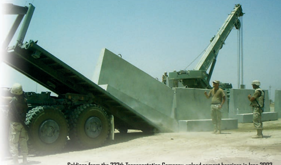
Soldiers from the 727th Transportation Company, unload cement barriers in Iraq 2003.

The South Dakota Air National Guard's 114th CES PRIME Base Engineer Emergency Force team deployed 52 Airmen to Kuwait in December 2008 to work on numerous projects to support combat airpower in the Global War on Terror.