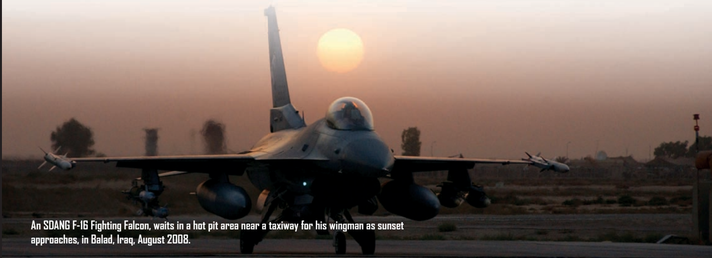
An SDANG F-16 Fighting Falcon, waits in a hot pit area near a taxiway for his wingman as sunset approaches, in Balad, Iraq, August 2008.

The South Dakota Army National Guard's Bravo Battery, 1st Battalion, 147th Field Artillery, headquartered in Salem with a detachment in Sioux Falls, deployed 177 Soldiers to Iraq Oct. 25, 2007, in support of Operation Iraqi Freedom.