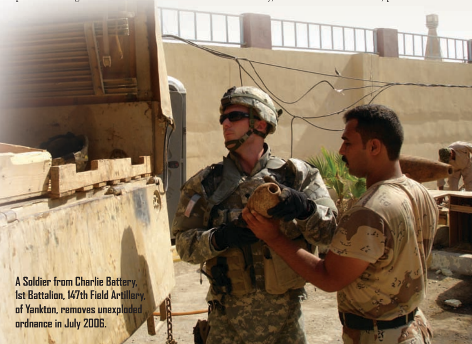
A Soldier from Charlie Battery, 1st Battalion, 147th Field Artillery, of Yankton, removes unexploded ordnance in July 2006.

The South Dakota Army National Guard's Charlie Battery, 1st Battalion, 147th Field Artillery, headquartered in Yankton, deployed 174 Soldiers July 13, 2005, to Kuwait in support of Operation Iraqi Freedom. The unit performed police transition team missions with the Iraqi Police, conducting joint patrols, route security, reconnaissance missions, personnel