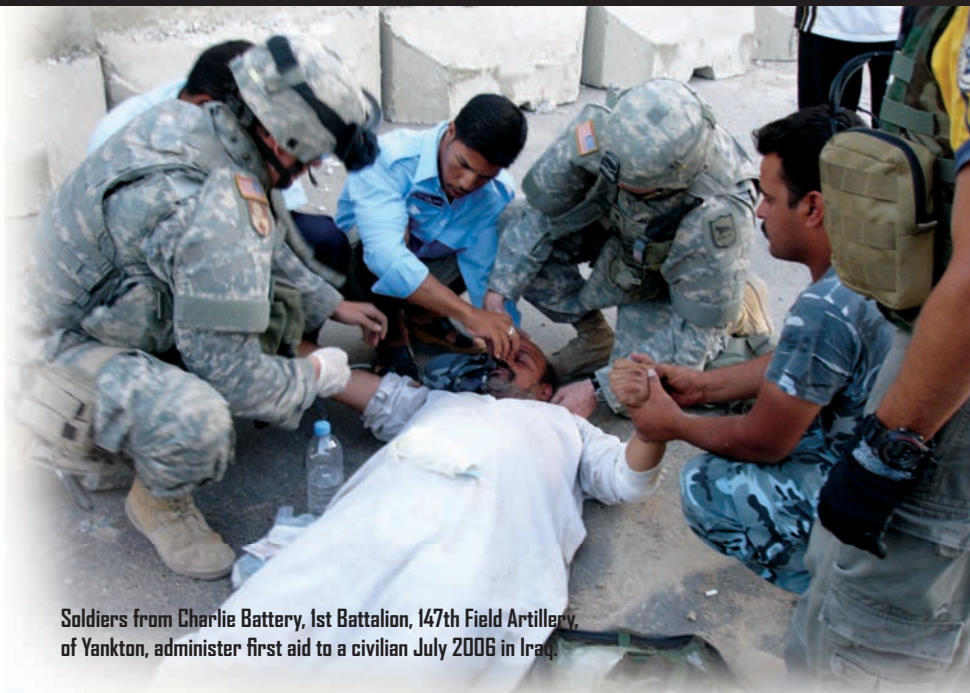
Soldiers from Charlie Battery, 1st Battalion, 147th Field Artillery, of Yankton, administer first aid to a civilian July 2006 in Iraq.

The 238th provided intermediate level maintenance for Army helicopters supporting Operation Iraqi Freedom. During the nine months spent in Iraq, the 10-member unit performed 20 UH-60 and CH-47 phases, completed more than 5,000 work orders and processed more than 25,000 parts requests. The Soldiers also used their civilian skills to help with numerous construction projects that helped improve the working conditions and quality of life for the battalion.