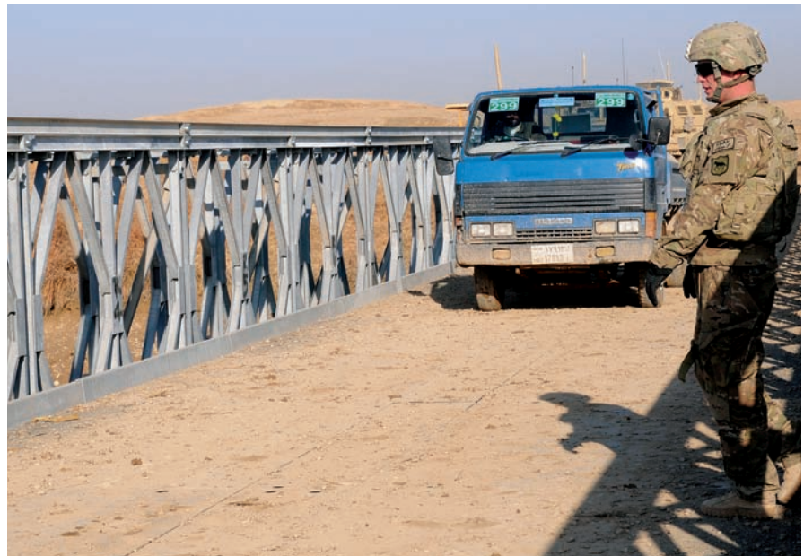
A vehicle passes over Tucker's Crossing on Jan. 27, 2012, in Helmand province, Afghanistan, constructed by members of the SDARNG's 200th Engineer Co.