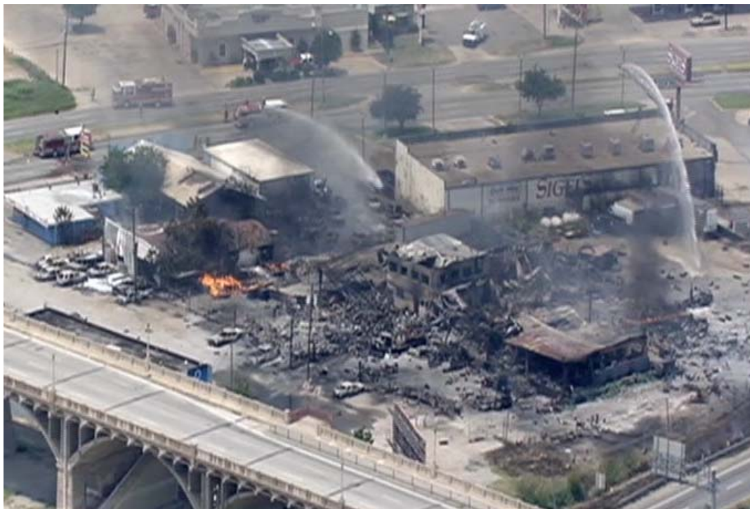
Figure 11. Final phase of fire suppression at Southwest facility in Dallas.