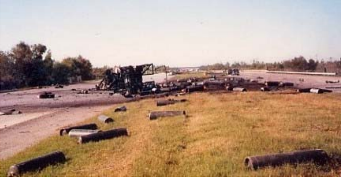
Figure 4. East New Orleans accident vehicle and cylinders.