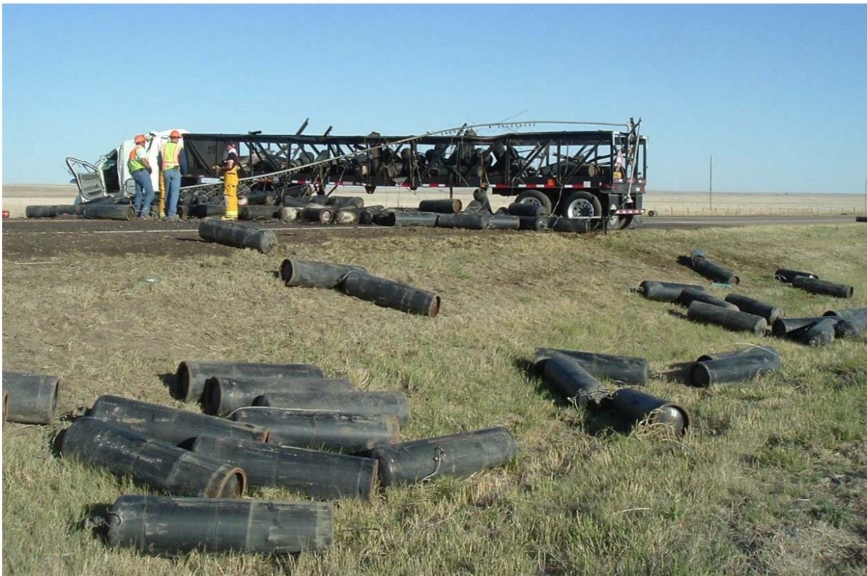
Figure 6. Lamar accident vehicle.

About 12:15 p.m. mountain daylight time on June 9, 2008, a southbound Western tractor and mobile acetylene trailer carrying 225 DOT 8AL specification cylinders (450 standard cubic feet capacity each) containing acetylene gas residue overturned on Highway 287 about 6.5 miles south of Lamar, Colorado. 12 As a result of the overturn, about half of the cylinders were thrown from the trailer, and acetylene gas from 86 of the 225 cylinders was released and ignited. (See figure 6.) The overturn damaged the tractor and the trailer. There was some fire damage on the trailer. There were no injuries from the accident. Property damage to the tractor and trailer totaled about $200,000.