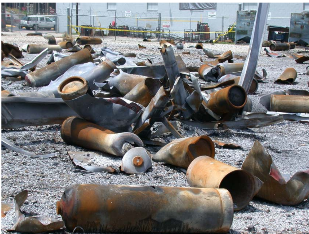
Figure 12. Dallas cylinder damage.