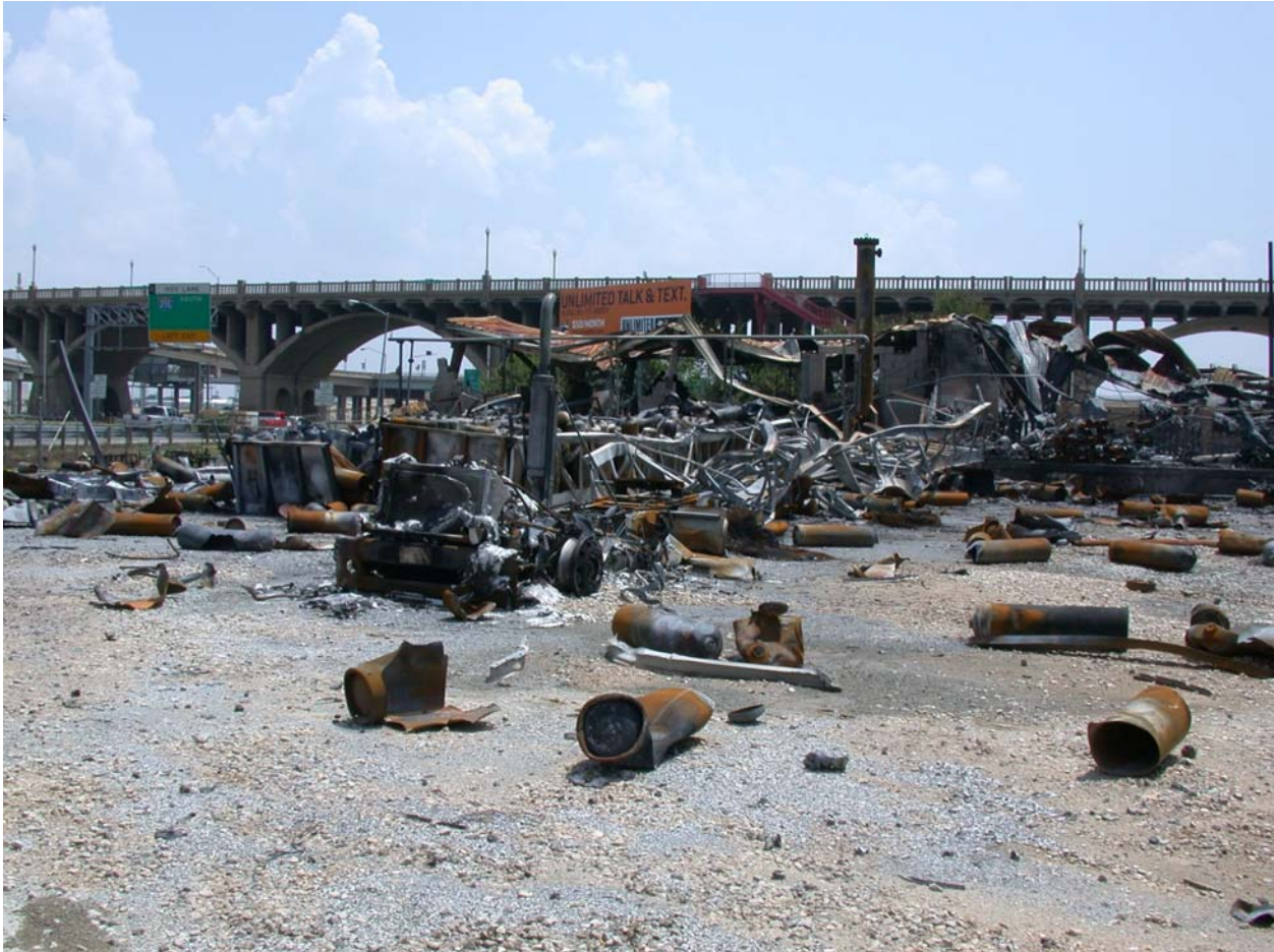
Figure 10. Dallas accident damage to Southwest facility and vehicles. (Accident trailer and cylinders in foreground.)

The accident trailer was filled and shipped from the BASF Corporation plant in Geismar, Louisiana. The capacity of the cylinders was approximately 100,000 standard cubic feet of acetylene. The operator typically worked in a two-person team that drove, loaded, and unloaded mobile acetylene trailers. The accident occurred during the operator's third delivery to Southwest, which was his first solo delivery to that location. He had made five solo deliveries to other facilities. The operator said that he had followed Western's standard operating procedures when he prepared the trailer for unloading at the Southwest facility. He said that after cycling the facility's discharge arm valve, leaving it closed (step 11 of Western's unloading procedures), he checked the pressure gauges on the manifold and both read 0 psig, which he did not identify as a problem. Step 4 of Western's unloading procedures requires that 50 psig of acetylene pressure remain in the manifold, and discussions with Western management revealed that at the completion of step 11 there should still have been slightly less than 50 psig pressure in the manifold.