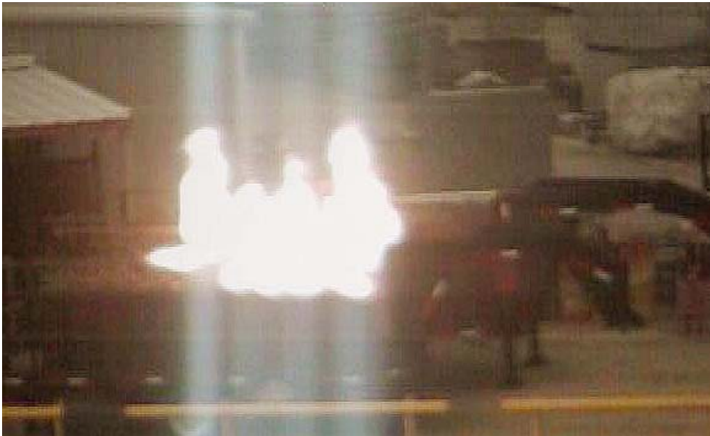
Figure 7. Security camera photograph of acetylene gas fire in The Woodlands, Texas.

About 2:55 p.m. on August 7, 2007, acetylene gas ignited on a Western mobile acetylene trailer containing 62 manifolded DOT 8AL specification cylinders (420 standard cubic feet capacity each) resulting in a fire on that trailer and an adjacent trailer at the Hughes Christensen plant in The Woodlands, Texas. (See figure 7.) The fire occurred as the operators were preparing the trailer to be unloaded. There were no injuries or fatalities. Property damage to the two trailers totaled $40,200.