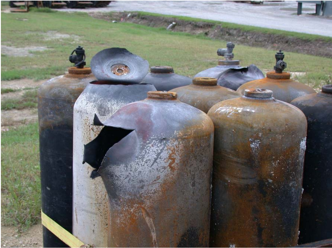
Figure 5. East New Orleans cylinder showing burst near head.