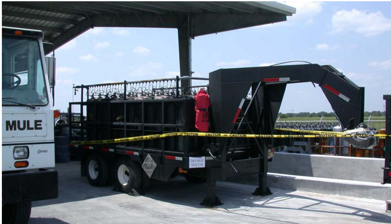
Figure 1. The Woodlands trailer (a small mobile acetylene trailer).

Figure 2 shows cylinders on a mobile acetylene trailer. The valve opening on each cylinder is connected by spiral tubing, called a pigtail, to the manifold that delivers or receives the acetylene gas to or from the cylinder. Attached to the manifold, on the back of the trailer, is a cargo transfer fitting, which is not visible in this photograph. This fitting is the connection between the trailer and the piping from the plant. The tubing and manifold piping are designed to contain the energy of an accidental decomposition reaction. A manual block valve (block valve) controls the flow of acetylene to and from the cargo transfer fitting. The piping includes an air-actuated valve that shuts off the flow if a trailer pulls away accidentally before it is disconnected. A needle valve on the manifold is used to reduce pressure on the manifold after cargo transfer and leak testing. Pressure gauges are mounted on the trailer: one on the manifold and one on the trailer piping between the block valve and the connection to the plant piping. According to Western, filling the cylinders through the manifold connection takes about 12 hours.