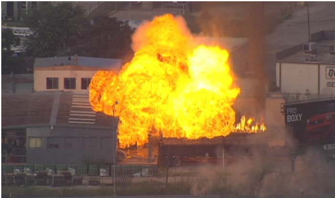
Figure 9. Acetylene gas fire at Southwest facility in Dallas.

About 9:50 a.m. on July 25, 2007, acetylene gas ignited on a Western mobile acetylene trailer containing 225 manifolded DOT 8AL specification cylinders (450 standard cubic feet capacity each) on the docks at the Southwest Industrial Gases (Southwest) facility in Dallas, Texas. (See figure 9.) The fire occurred as the operator was preparing the trailer to be unloaded. A video recording made by a Dallas television network did not record the initiation of this accident; however, it showed a gradual progression of the fire and explosions from the trailer on which the operator was working to adjacent trailers, to Southwest's building, and to vehicles parked in front, one of which contained acetylene-filled cylinders for delivery. The fire and explosions destroyed the Southwest facility and many vehicles, damaged several nearby buildings, and caused the failure of hundreds of acetylene-filled cylinders from three other Western acetylene trailers, 13 the delivery truck, and the facility's docks and storage. (See figure 10.) The operator sustained back injuries, and the plant manager and general manager were severely burned during the accident. There were no fatalities. Property damages have not been fully assessed, but Southwest estimated losses of more than $5 million.