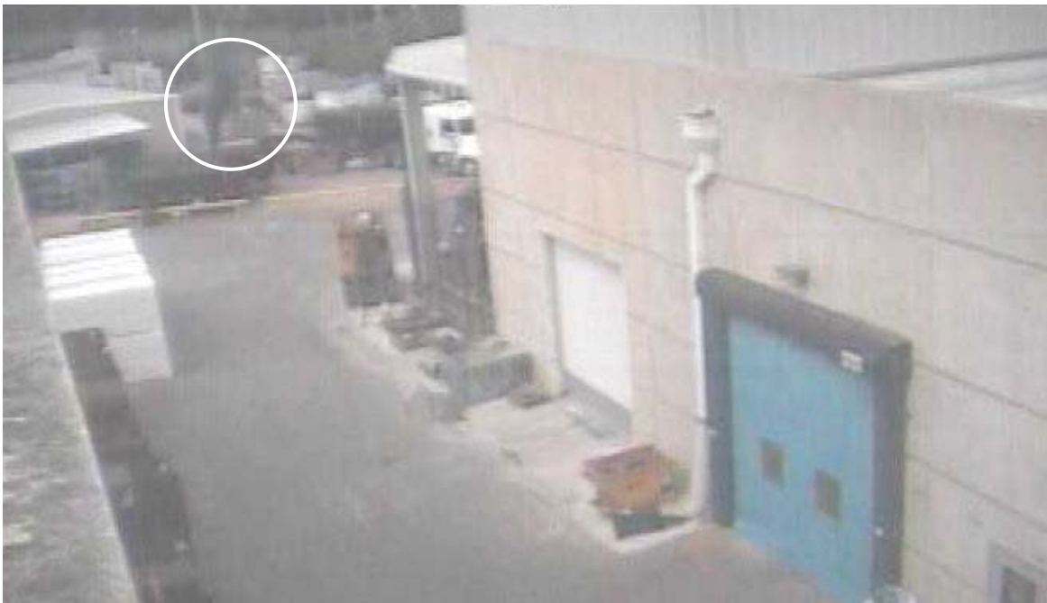
Figure 8. Security camera photograph of black plume coming from a cylinder on trailer in The Woodlands, Texas.

were standing on the ground at the back of the trailer near the trailer's block valve and attachment to the plant's discharge arm, but the focus of the camera was not adequate to show what they were doing. During postaccident interviews, both operators said that they had believed that they had completed the connection procedures and had pressurized the manifold. They told interviewers that after they had reviewed Western's standard operating procedures manual, however, they realized that they had not opened the block valve before pressurizing the manifold as Western's procedures required. Just after the accident, the trainee operator told a Hughes Christensen employee that the trailer had jumped as they opened the block valve. Shortly after that, the security camera recorded a black plume coming from one of the cylinders on the trailer. (See figure 8.) A similar reaction occurred on other cylinders on the trailer until the released gases ignited. Heat from the fire on the accident trailer caused the release of unreacted acetylene gas on an adjacent trailer.