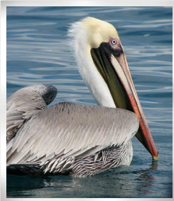
Pelicans are among the many species of seabird found in the Farallones sanctuary.