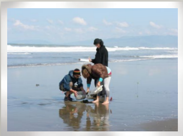
LiMPETS student volunteers monitor a shoreline.