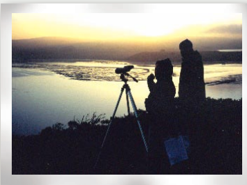
Tomales Bay is an area of great ecological significance.