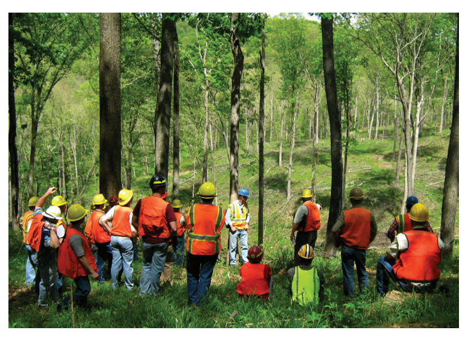
Tour of area with five prescribed fires, an herbicide application, and a shelterwood harvest.

Though research on the VFSEF was initiated in cooperation with forest industry, it has been used by forestry practitioners, researchers, students, landowners, policy makers and the public. Research results are communicated through forest tours, demonstration areas, presentations, and publications. Visitors from as far away as China regularly travel to the VFSEF to see side-by-side comparisons of outcomes of management alternatives. More than 200 scientific publications have been produced so far, and much of the Forest Service's data and publications are electronically available to researchers and students.