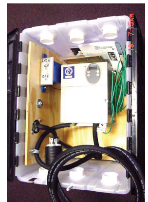
VFD mounted in box

4. Other Options - For added flexibility, consider a variable frequency drive (VFD). The VFD is easy to operate, can convert single-phase power from small generators to three-phase power, and can supply power under a variety of horsepower demands. Small, portable generators that can be used with a VFD are readily available from the nearest hardware supplier. Consult your licensed electrician to see if a VFD is right for your utility.