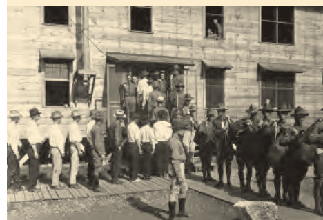
"Drafted men reporting for service." Drafted men reporting for service. Camp Travis, San Antonio, Texas. 1917-1918. San Antonio Chamber of Commerce. (War Dept.) WAR & CONFLICT BOOK #: 443

Over 4 million policies were issued during World War I. With each succeeding war, the government, through VA, continued to provide coverage to military members while on active duty and after separation.