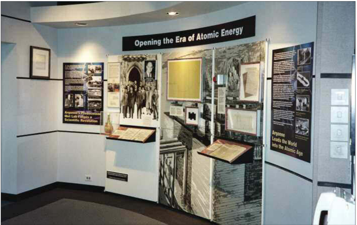
To the right of the entrance to the exhibit is a display of items that were part of a 1992 U.S. National Archives traveling exhibit on Chicago Pile-1, in which the first self-sustained chain reaction occurred. The traveling exhibit was passed on to Argonne in the mid-1990s. (Tilbrook)