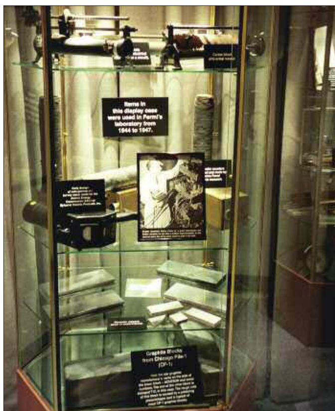
Another display case in the artifact room contains items Enrico Fermi used in his lab from 1944 to 1947. On the top shelf are several rheostats; on the second shelf are collimator counters designed and made by Fermi for his research; on the third shelf are several reflectors; and on the bottom shelf are two blocks of the graphite from CP-1 with identification markings on them.