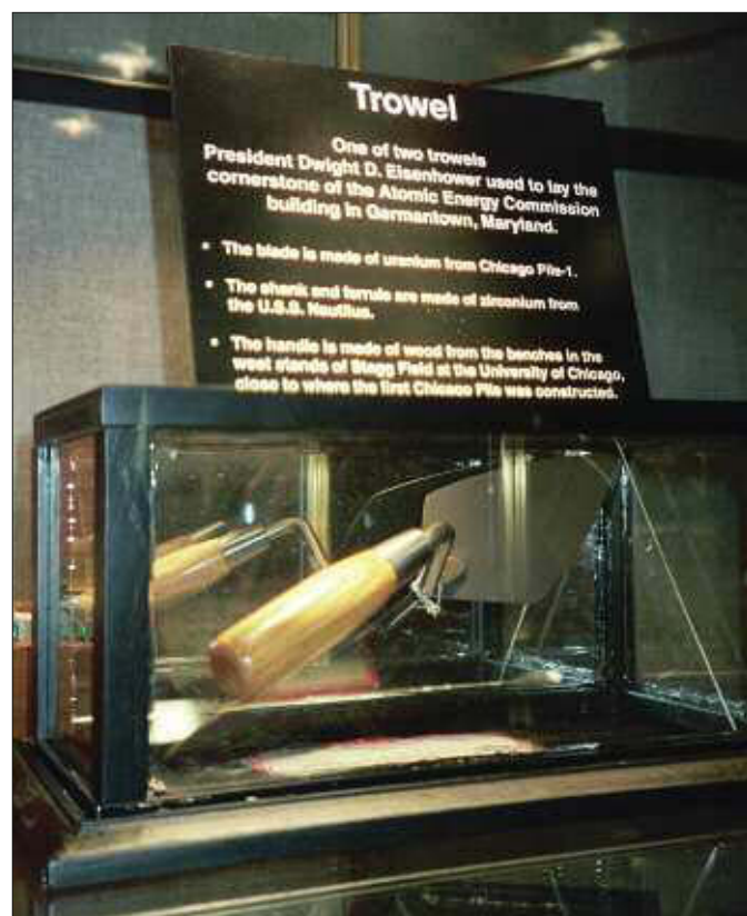
A mirrored display case in the artifact room holds one of two trowels used by President Dwight D. Eisenhower on November 8, 1957, to lay the cornerstone of the Atomic Energy Commission's building in Germantown, Md. It is, however, no ordinary trowel: The blade is made of uranium from CP-1; the shank and ferrule are made of zirconium from the U.S.S. Nautilus ; and the handle is made of wood from the benches in the west stands of Stagg Field at the University of Chicago.