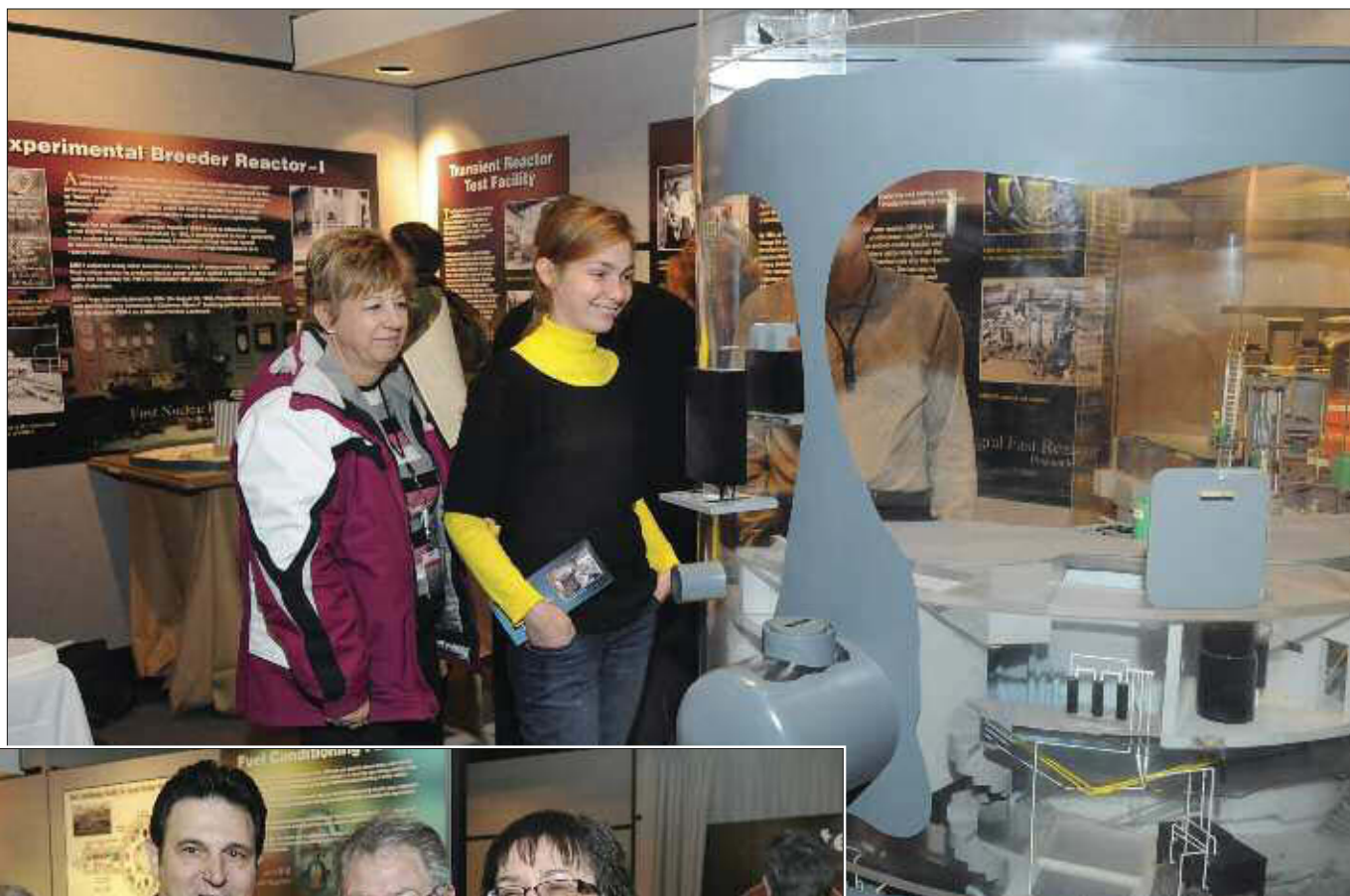
Above: A couple of visitors look over the Experimental Breeder Reactor-II (EBR-II) model. (Joch)