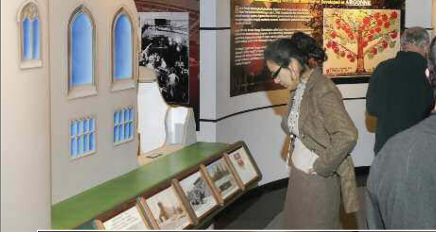
Left: A visitor examines the CP-I exhibit, which includes a cutaway model of the football stadium at the University of Chicago's Stagg Field to show the reactor underneath. (Joch)