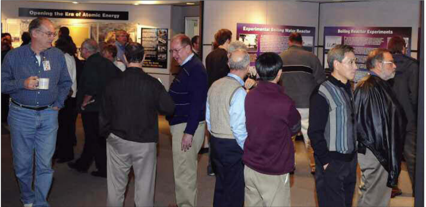
Below: The crowd peruses the various displays in the exhibit area. (Joch)