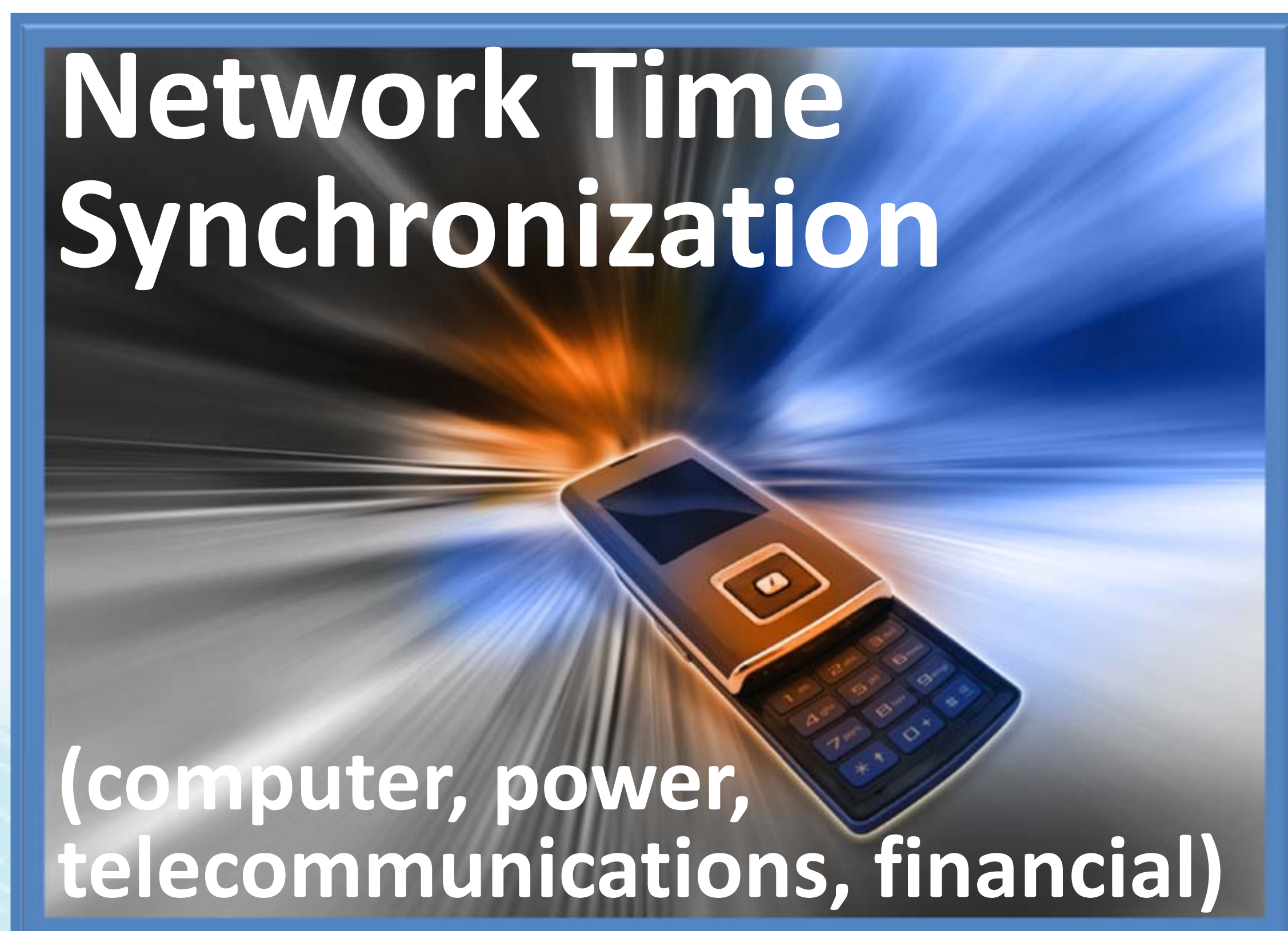
Network Time Synchronization

(computer, power, telecommunications, financial)