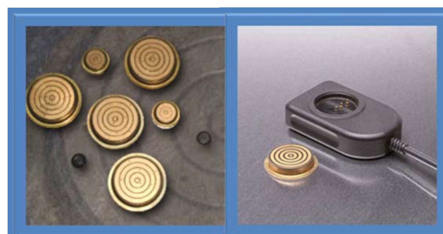
Contact Memory Buttons