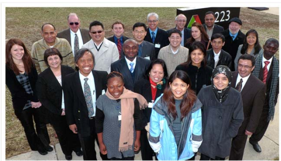
IAEA/Argonne Workshop on Developing the Safety Infrastructure for a Research Reactor in an Emerging Nuclear Power State (Argonne, IL : March 7-11, 2011)