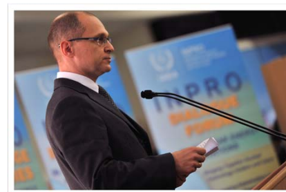
IAEA's 10 Years of INPRO – Sustainable Nuclear Energy for the 21st Century