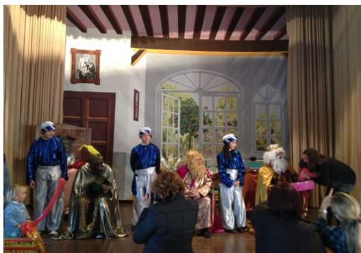
The Three Kings and their assistants give toys to the well-behaved children.