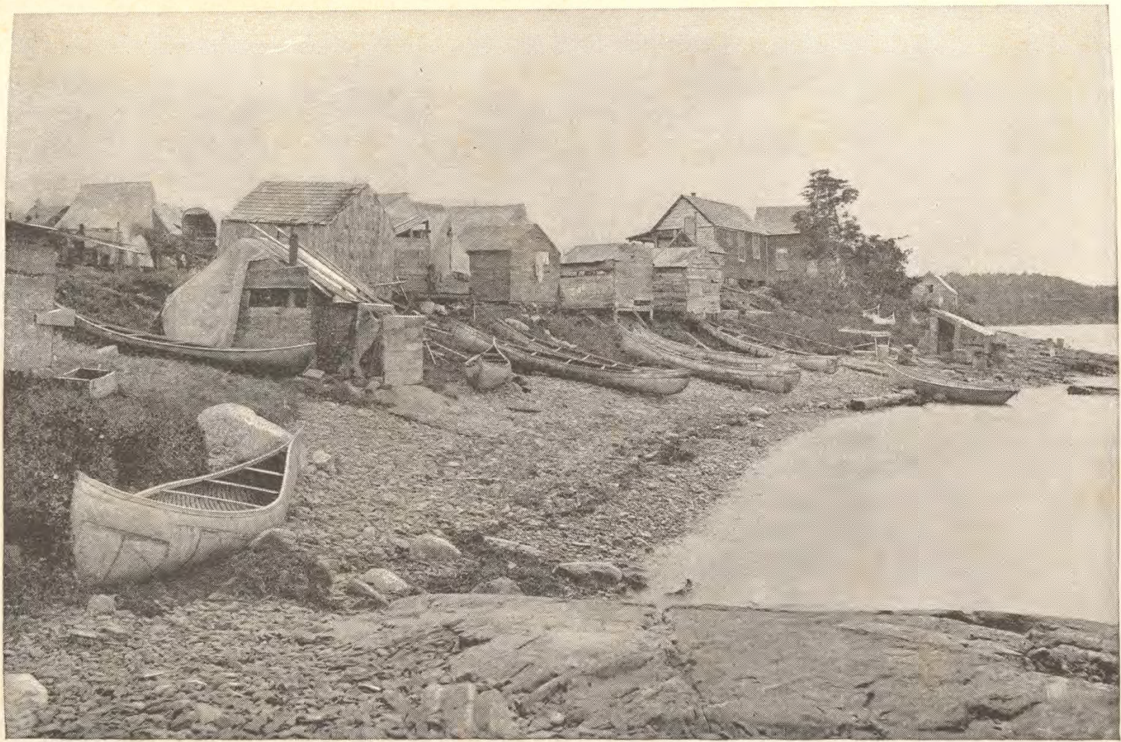
Old Indian Village.