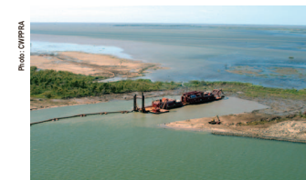
Located in Plaquemine Parish, La., the CWPBRA West Bay Sediment Diversion Project is the largest wetlands restoration effort of its kind in the world. The project's primary purpose is to rebuild marsh. The project is a partnership between the U.S. Army Corps of Engineers and the Louisiana Department of Natural Resources. The 85 percent federal share is funded by the Coastal Wetlands Planning, Protection and Restoration Act.

Since 1990, more than 145 CWPBRA projects have been constructed or approved for construction. During the 20-year life span of each project, over 70,000 acres of land are expected to be created or protected, and an additional 320,000 acres enhanced.