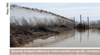
Spraying dredged sediment to restore marshes to specific elevations is one of the techniques used to reverse coastal wetland loss.

Although current funding levels do not support all of the necessary restoration required for a sustainable ecosystem, CWPBRA continues to address immediate restoration needs while establishing a foundation of strong science, public participation, and agency cooperation that will continue to serve as the cornerstone of future programs.