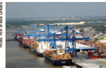
Photo: Port of New Orleans With 500 million tons of waterborne cargo passing through Louisiana's system of deep-draft ports and navigation channels, the state ranks first in the nation in total shipping tonnage. When Hurricane Katrina made landfall on August 29, 2005, it stalled the transportation supply lines for imports and exports in the area.

Between the two extremes - collapse and preservation - lies a natural world that supports almost one-fourth of the domestic oil and gas production and the largest seafood harvest in the lower 48 states. Wetlands protect one of the largest shipping and fuel production corridors in the U.S. from hurricanes and open sea conditions. Just one of Louisiana's major ports receives about a million barrels of oil every day—roughly 13 percent of the nation's foreign oil supply.