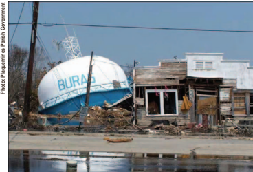
Storm surge from Hurricane Katrina (Aug. 29, 2005) devastated the town of Buras, Louisiana. The Buras water tower was completely destroyed.

that live and depend on this valuable region. Healthy marsh provides a buffer to these storms, and the wetlands' ability to absorb high water and to slow strong winds is key to the survival of coastal communities. Every year, as wetlands lose ground, these forces hit harder and closer to home.