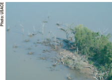
More than 1,900 square miles of Louisiana's coastal wetlands have disappeared into the sea.

As this land disappears, tropical storms and hurricanes like Katrina and Rita strike populated areas with greater force and bring devastation to the many people and businesses