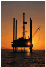
The oil and natural gas industries have a value exceeding $16 billion a year. Twenty-six percent of U.S. oil and natural gas production originates, is transported through, or is processed in Louisiana's coastal wetlands.

Louisiana's land loss problem is multifaceted, but both human and natural factors have contributed to this crisis. The Mississippi River levee system, built after the Great Flood of 1927 to contain high water, significantly contributed to the problem. The levee system, while protecting communities from high waters, disrupted the natural aquatic flow, drainage, and sedimentation of the wetland hydrology. Construction of canals and waterways for the oil and gas industry further weakened the integrity of these wetlands. In addition, natural processes compounded the problem as storms, rising sea level, erosion, and subsidence (compacting of the soil) have all taken a toll on coastal Louisiana.