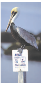
Residents of Louisiana are saddened by the recovery of the state bird, which thrives in warm, coastal, estuarine environments. Designated as endangered in 1970, the Brown Pelican's U.S. population now exceeds historic levels.

An ecosystem of enormous national significance is vanishing into the Gulf of Mexico at an alarming rate. In the past century, Louisiana has lost more than one million acres from its coast. Every 42 minutes one acre, an area roughly the size of a football field, vanishes. With every acre lost, an essential habitat moves closer to extinction. Billions of dollars in seafood production, oil and gas revenue, and commercial shipping will be lost without Louisiana's coastal wetlands, which provide the basis and support for these critically important national industries. In terms of human life and culture, the value of these wetlands is beyond estimation.