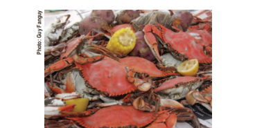
Louisiana is by far the nation's largest producer of shrimp, oysters and blue crab.

CWPBRA projects have benefited the coast while creating a real-world framework for restoration research and technology. Although successful, CWPBRA is only part of the solution. To meet the challenge of reversing land loss, established techniques and project scale must go to the next level. The catastrophic level of wetland loss in Louisiana requires both landscape-scale restoration and greater stakeholder involvement in reaching a common goal: a sustainable coastal Louisiana. CWPBRA has taken the first steps in achieving this goal and is continuing to provide the necessary framework and immediate response to address Louisiana's coastal crisis.