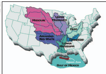
Runoff from farms, cities and factories flows into the Mississippi River drainage basin. The nitrates and phosphates that eventually reach the Gulf of Mexico create algae blooms that decompose, depleting the water of oxygen. Hypoxic waters are commonly known as "dead zones."

Furthermore, as canals and commercial waterways dissected the wetlands, salt water began to intrude upon and kill existing freshwater vegetation. The root systems of these plants holds land in place; without it, the land crumbles. As salt water seeps into freshwater areas, vegetation dies and the process, steadily moving inland, continues to repeat itself. Combined with reduced freshwater inflow from the Mississippi River, the result is a starving ecosystem under attack.