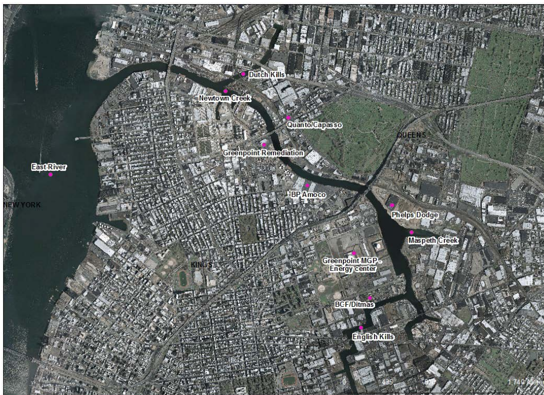
Figure 1. Newtown Creek Assessment Area

The Newtown Creek Superfund Site was added to the National Priority List in 2010. Newtown Creek forms a portion of the boundary between the Boroughs of Brooklyn and Queens, in Kings and Queens Counties, New York. Newtown Creek includes the tributaries of Dutch Kills, Maspeth Creek, Whale Creek, East Branch, and English Kills. The entire Creek system is approximately 3.8 miles in length and discharges to the East River near Hunter's Point and Roosevelt Island (USEPA 2009) (Figure 1). It flows through a highly industrialized area, is estuarine, and experiences tidal fluctuations of approximately two to six feet (New York City Department of Environmental Protection [NYCDEP] 2011). Newtown Creek is classified by the NYSDEC as Class SD saline water, a NYSDEC classification that indicates the best use of this Creek is fishing and that the waters should be suitable for fish survival. However, since 2004, Newtown Creek has been listed on the U.S. Environmental Protection Agency (USEPA) Clean Water Act 303(d) list as impaired due to oxygen depletion.