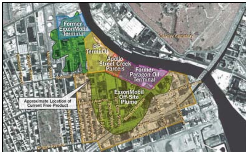
Figure 2. Greenpoint Areas of Remediation