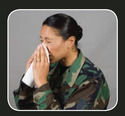
To help stop the spread of germs, cover your mouth and nose with a tissue when you cough or sneeze.