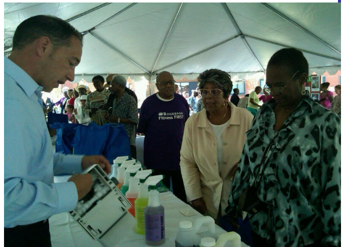
Council Tower residents learn about environmentally friendly cleaning products during a 'green' fair at the Roxbury, Mass. senior housing development. Residents had the opportunity to learn about healthy living choices; ways to improve energy efficiency in their homes, and many other green living options available to them.

benefits by encouraging the use of recycled building materials, reflective roofing, and non-toxic products to reduce potentially harmful 'off-gassing' of harmful fumes. Funds are awarded to owners of HUD-assisted housing projects and can be used for a wide range of retrofit activities, ranging from windows/doors to solar panels and geothermal installation. For more information go to New England Green Retrofit grants .